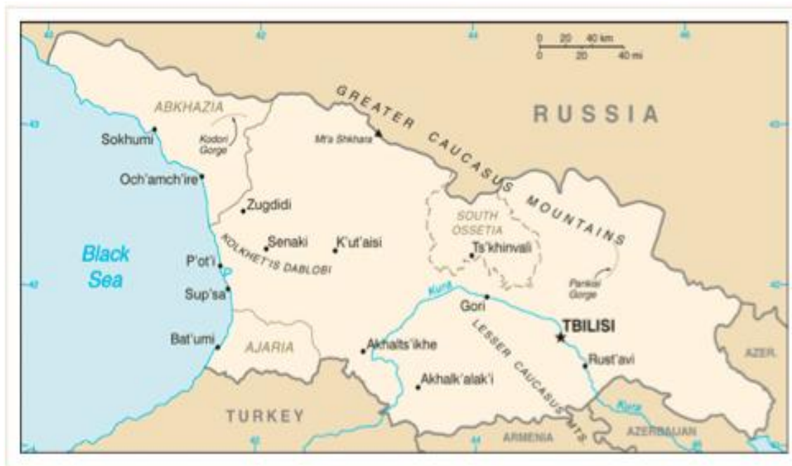
Figure 1 The republic of Georgia (CIA World Factbook 2011)