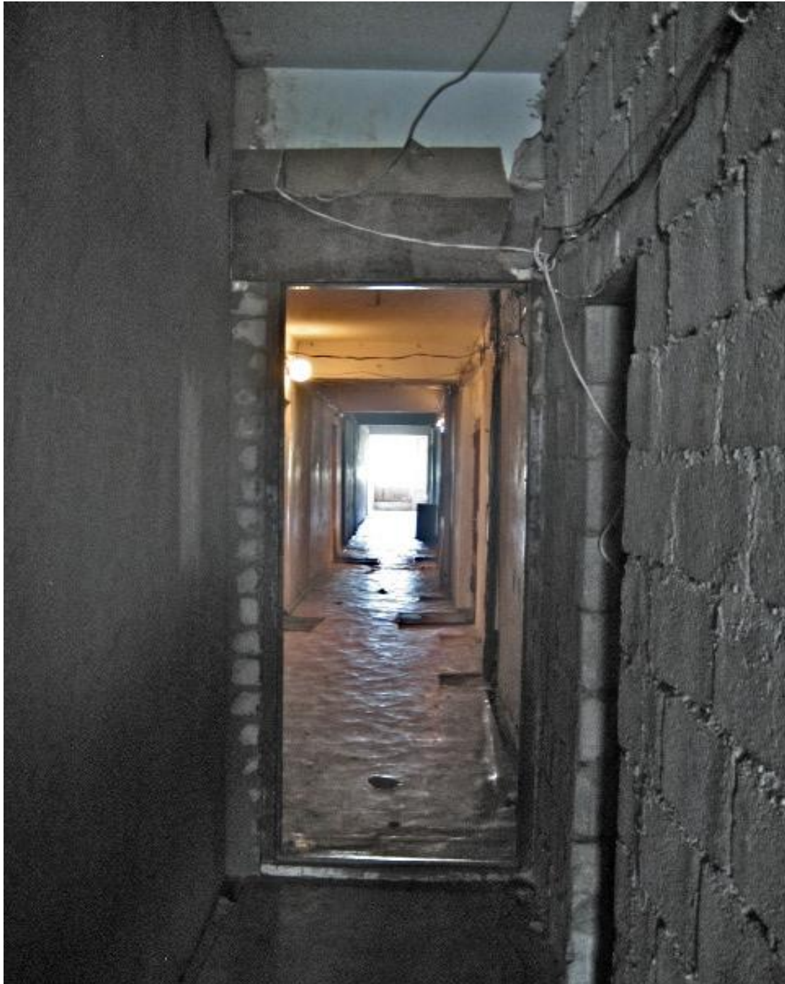
Figure 2 Picture of hallway in Collective Centre