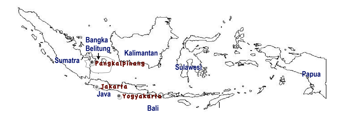
Figure 1: Map of Indonesia.

The aim behind introducing distance education has been to provide higher education to students nationwide (Kuntoro & Al-Hawamdeh, 2003; UNESCO, 2001b). However, although the arguments have often been related to geographical issues, from the outset at UT a large and significant number of students have come from urban lower-income groups (Suparman et al., 2004).