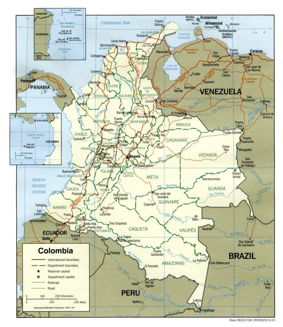
The Republic of Colombia (CIA 2001)