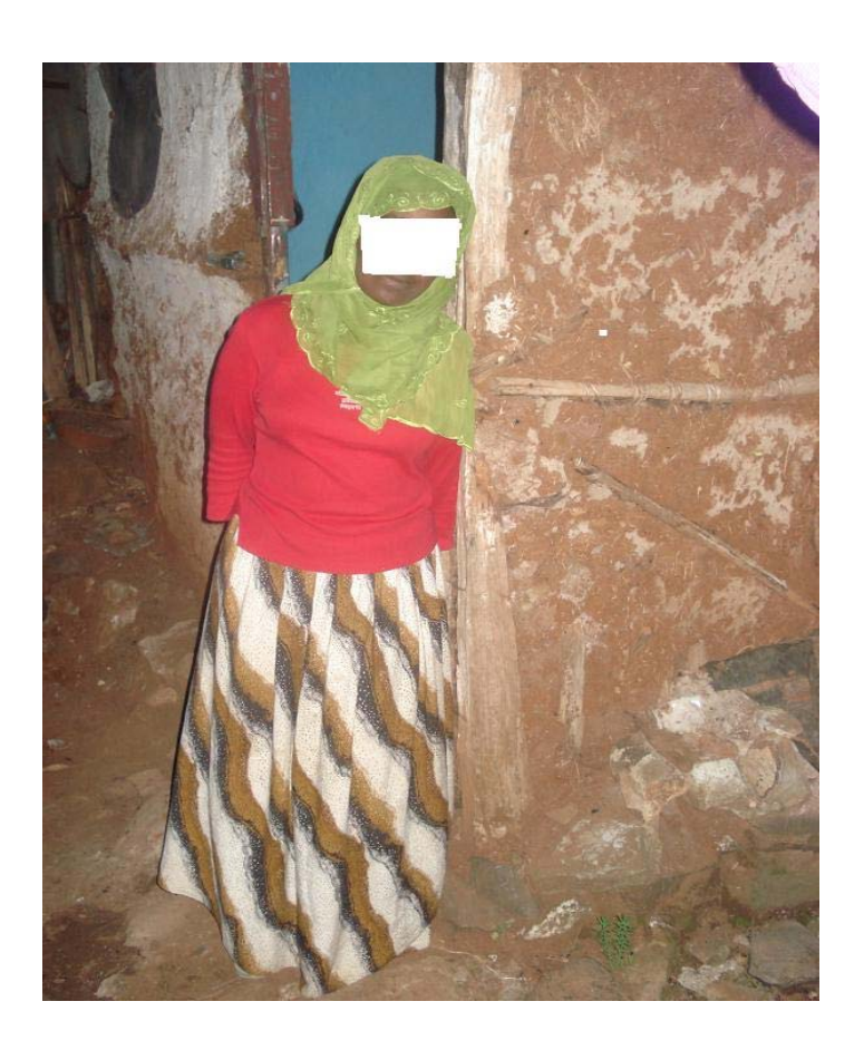
Figure 3: A woman dressed with long dress and the head covered

The fact that in the Orthodox religion there are consequent fasting times and various food specifications makes it difficult for Orthodox Christians. Whereas for Muslim migrants it presents a good experience to be able to exercise their religion in the area of origin of the religion.