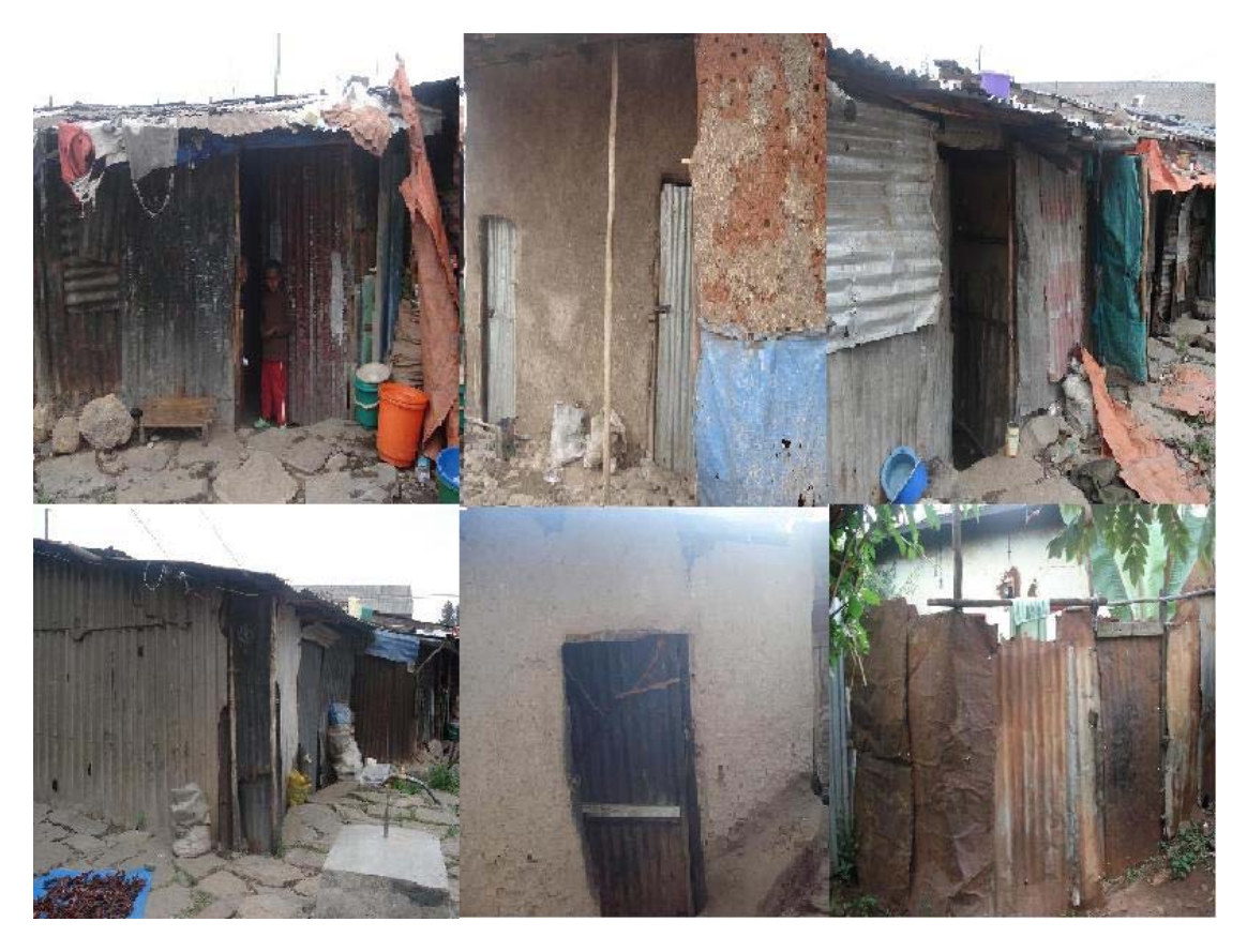
Figure 4: Government owned houses in a below average income neighbourhood

neighbours very well because of the setting of the houses: They often share a compound with each other. In such a neighbourhood, the Ethiopian culture of drinking coffee together with the neighbours is experienced to a great extent.