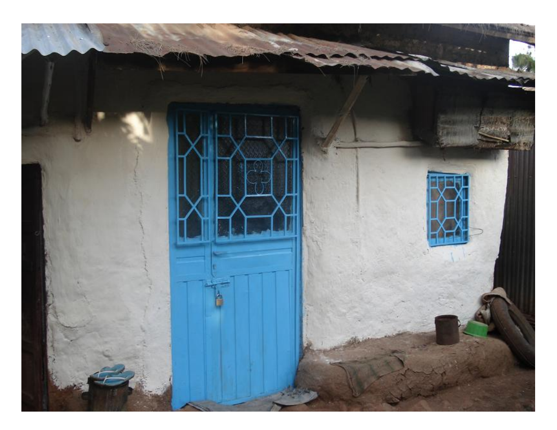
Figure 8: A typical returnee's house

siblings' studies at different levels. Yetinayet sent her daughter by borrowing money but after her daughter paid off her debt she started sending money. 'My daughter sends us money once in a while and we spend it. But we also use it to finance the study of her younger sisters' Yetinayet says. Poor families also spend the money to get additional facilities like telephone lines and phones, television, electricity, water supply and furniture, also to pay bills for the various facilities. But some even could use it for renewing the status of the house like the wall, painting and redoing it with better material like cement in the outside and the floor also often with cement or plastics. Doors and windows are often changed to metallic doors which are in most cases considered more classic (Refer figure 8).