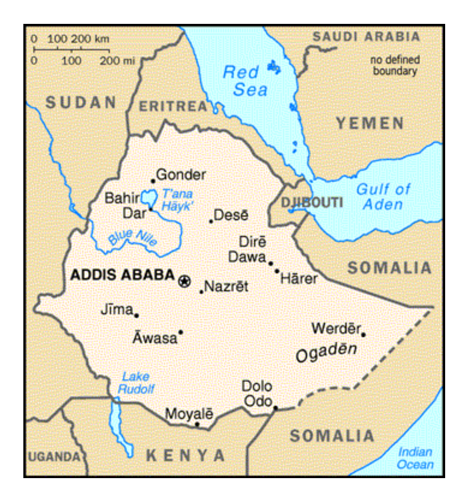
Figure 2: Map of Ethiopia