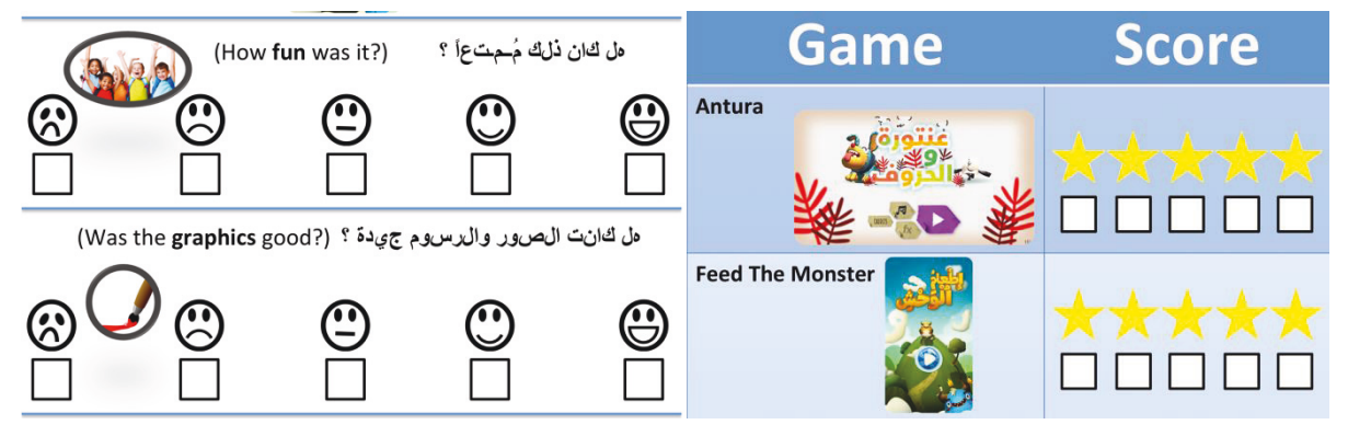
Figure 2: Left: Part of the Per-game evaluation form. Right: Part of the final evaluation form

Figure 1: Overview of the EduApp4Syria multi-stage innovation competition