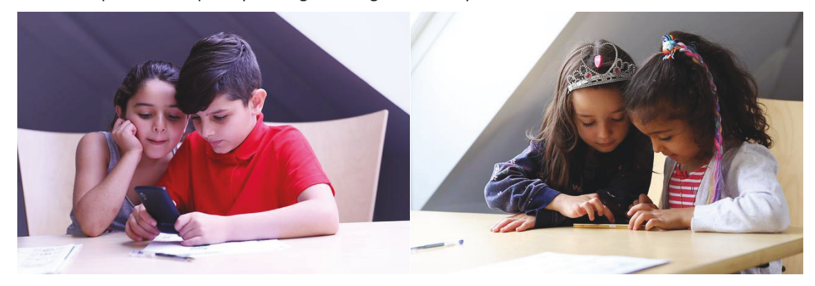
Figure 3: Pictures from the user test in Trondheim, Norway

The third user test took place within the mosque area, and we were given two rooms for most of the sessions. Only two or sometimes three children would have parallel sessions in one room, and the rest of the children who were not playing were in a separate room. There were not many issues regarding hearing audio this time, as the room was big, the children were spread out, some children were pre-tested while others played the game. However, there were still some challenges. Children who were playing the game were distracted when other children whose session had not started yet began to play with each other and jumping around in the other room, and vice versa children outside wanted to start playing the game soon. Also, children would get distracted and started looking around when it was noisy, mostly when people coming and leaving the room. The organizers from the mosque were frequently coming in during the first days to monitor research.