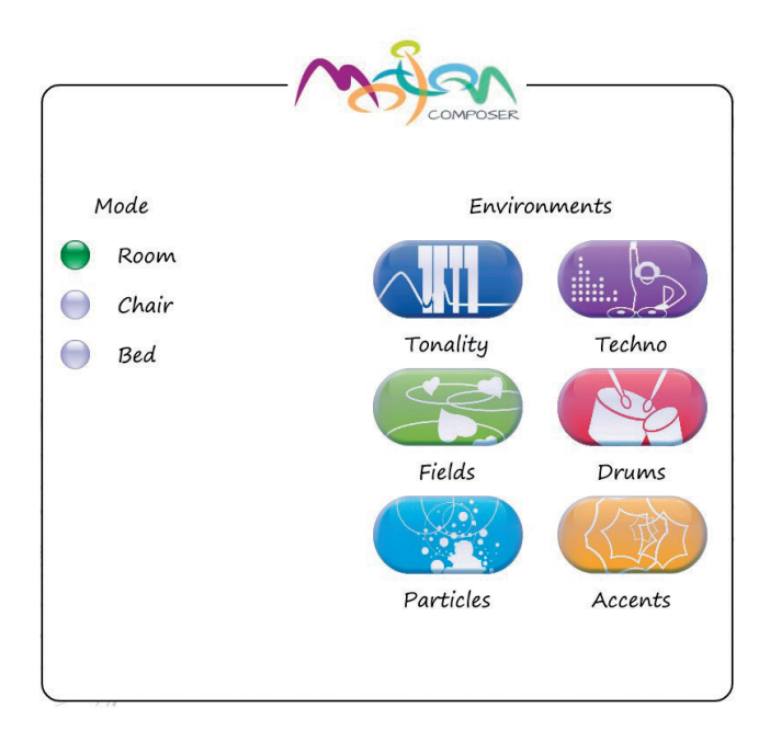
Figure 1. MC, graphical user interface (GUI)

In addition, the user or therapist can adjust the volume and sensitivity – the latter to compensate for the fact that users with different abilities can have vastly different quantities of movement under their conscious control.