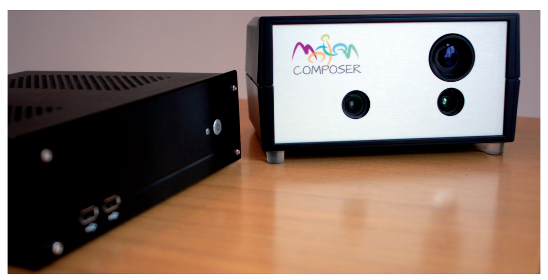
Figure 2. MC hardware

The MC 2.0 contains a small (ATX format) computer and two video sensors: an ASUS time-of-flight (TOF) depth sensor and a CCD Ethernet bus video camera (cf. Figure 2).8