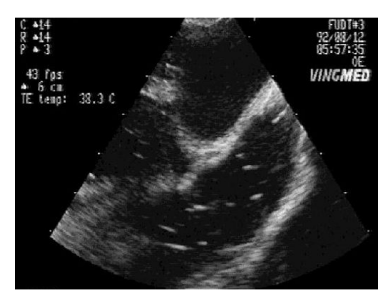
Figure 2. Transesophageal echocardiography from decompression experiment with pig.

An optimal view of the heart can be obtained by transesophageal echocardiography (TEE) where the transducer is mounted on a gastroscope and inserted into the esophagus. The transducer is very close to the heart, enabling use of higher frequencies than with precordial imaging, so it is easy to obtain a constant view with a high level of detail (Figure 2). This technique is used clinically in examinations requiring particularly high image quality, e.g. diagnosis of patent foramen ovale (PFO), usually in combination with an ultrasound contrast agent. The use of TEE transducers is definitely uncomfortable for the patient and although complications are rare, perforation of the esophagus has been described (105). For decompression research this technique is therefore limited to animal experiments (106;107).