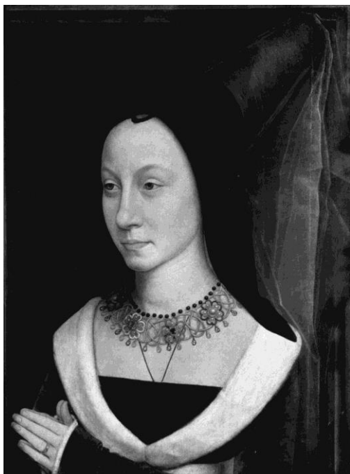
FIG. 2 – Hans Memling. Portrait of Maria Portinari , Metropolitan museum, New York.