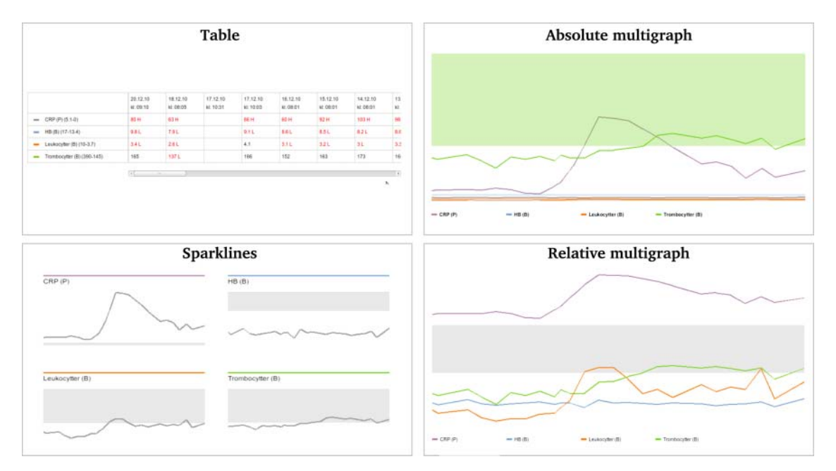
Figure 1 Four visualizations of the same laboratory data (the chronic patient case).

No numerical values were visible in any of the line graph visualizations, and all line graphs were plotted in the opposite chronological order to that of the table (ie, line graphs had