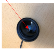
Fig. 1. MKE2 P-C condenser microphone fixed on the chest piece of stethoscope

The bowel sounds used in our experiments are collected from two volunteers enrolled in a pilot study approved by the Regional Ethical Committee. These subjects self-reported to have no gastrointestinal disorders. On the day of recording, the subjects had their usual breakfast and fasted until lunch. The bowel sound data is recorded during the regular lunch time of the individuals. The recordings from subject 1 are done in an echo-free recording room, while the recordings of subject 2 are done in a typical lunchroom.