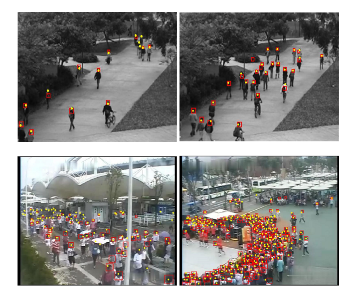
Fig. 3 . Results of samples frames from UCSD and World-Expo'10 data sets. The yellow dot represents the groundtruth while the red bounding box is the predicted location by our approach. The Figure can be best viewed in color.

We also quantify and compare the localization performance of our method with other state-of-the-art methods. In order to quantify the localization error, we associate the center of estimated bounding box with the ground truth location (single dot) through 1-1 matching strategy. We then compute Precision and Recall at various thresholds and report the overall localization performance in terms of area under the curve. In order to estimate the location, we use the same density maps generated by state-of-the-art methods followed by non-maxima suppression algorithm. The results are reported in Table 2. It is obvious that our proposed model presents higher Precision and Recall rates as compared to the stateof-the-art methods. These results attribute to the fact that our model generates scale-aware proposals that capture wide range of head sizes in each image. It can also be observed that all other methods present lower rates for WorldExpo'10 dataset as compared to UCSD dataset. This is due to the fact the WorldExpo'10 dataset contains more dense images with heavy occlusions as compared to UCSD. We also show some qualitative results of our proposed method in Fig. 3. The first row depicts the sample images from the UCSD dataset which