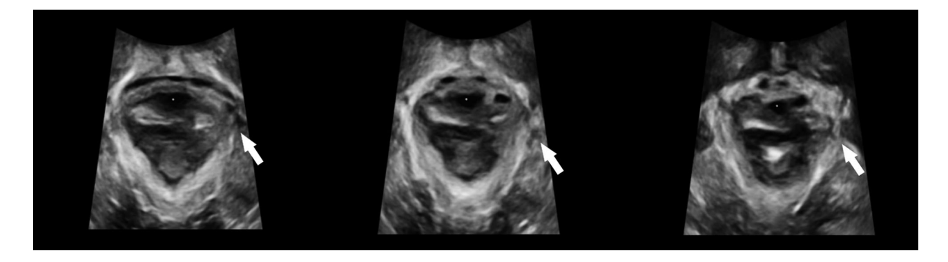
FIGURE 2 Left sided levator ani muscle (LAM) injury (white arrow) on tomographic ultrasound imaging at maximal levator contraction. Intact LAM on the right side

Urinary Distress Inventory (UDI-6) and Colorectal Anal Distress Inventory (CRADI-8), range, 0 to 100.<sup>17</sup> We also registered the proportion of women with urge urinary incontinence (UUI), SUI, and leakage of loose or formed stool, when answering "yes" to the questions: "Do you usually experience urine leakage associated with a feeling of urgency, ie, a strong sensation of needing to go to the bathroom?", "Do you usually experience urine leakage related to coughing, sneezing, or laughing?," "Do you usually loose stool beyond your control if your stool is well-formed?," "Do you usually loose stool beyond your control if your stool is loose?." The proportion of women with any UI or FI was calculated, including women who had undergone any previous incontinence surgery, as some of them were now asymptomatic.