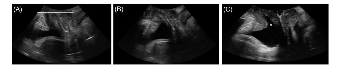
FIGURE 3 Bladder neck descent is measured as the difference between (A) rest and (B) Valsalva. The horizontal solid line is drawn through the inferior-posterior level of the symphysis pubis and the dashed vertical lines show the distance to the bladder neck. (C) Urethral funneling (asterisk) is seen as a dilatation of the proximal urethra at Valsalva

Offline analysis of the ultrasound volumes was performed 6 to 24 months after the ultrasound scan on a computer using the 4D view Version 14 Ext.0 (GE Healthcare, Austria) software, blinded to all clinical data. Tomographic ultrasound imaging was used to identify significant LAM injury at pelvic floor muscle contraction. A significant LAM injury was diagnosed if all three central slices; the slice in the plane of minimal hiatal dimensions and the slices 2.5 and 5.0 mm cranial to this, showed abnormal muscle insertion (Figure 2).<sup>18</sup> Injury was diagnosed as unilateral or bilateral, and the number of women with significant levator injury (unilateral or bilateral) was registered. A defect of the external or internal anal sphincter of \geq 30^{\circ} in at least four of six slices on tomographic ultrasound imaging was considered a significant defect.<sup>19</sup> BND was assessed in the midsagittal view, see Figure 3. A horizontal line was drawn from the posterior-inferior margin of the pubic symphysis, and the distance from the bladder neck to this horizontal line was measured at rest and Valsalva. BND was calculated as the