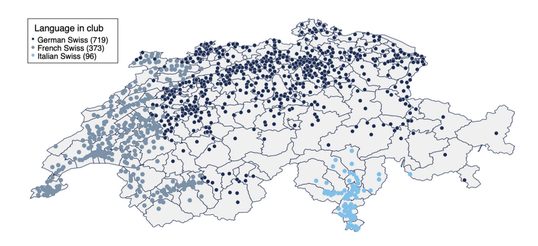
Fig. 1 Amateur football clubs and their primary language in Switzerland.