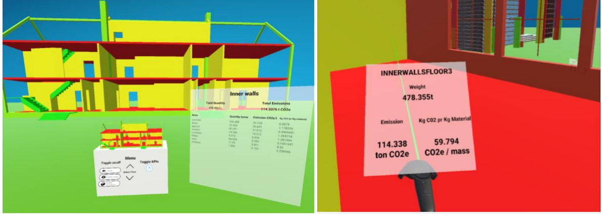
Figure 3. ZEB View of a building using VR to visualise emissions and by listing materials in tabular form

If the user selects one specific building in the ZEN view, they teleport down to the ZEB-level (Building level). This view focuses on one particular building, and serves the purpose of communicating the KPI GHGemissions for both each building part and every material in said building part. This view has two models; one 1:1 model where the user can teleport inside and experience/inspect the building. The other is a "dollhouse"model where the user can inspect and interact with the building by clicking on building parts. The user is also presented with a menu for toggling between different building parts. The KPI score is visualised using colorisation similar to the ZEN-view. The user can choose two different approaches; the first compares the performance of each building part to the total emission of the building. The second approach weights the building mass as part of the equation and returns a score based on both the emission and building part mass compared to total building mass. If the user selects one specific part, they get presented with material information in tabular form for the selected element. In addition to the tabular form, the materials used will be visualised in actual size and weight so the user can put the quantity of materials into context. The intensity of the emission is visualized by using the same columns from ZEN-View. The purpose again is to give the user a more immersive experience and to put the numbers into context.