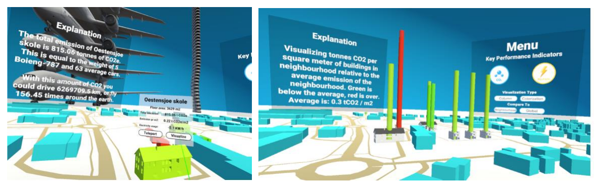
Figure 2. Snapshot in ZEN View of the Sluppen area using VR to visualise emissions of buildings

IOP Conf. Series: Earth and Environmental Science 323 (2019) 012074 doi:10.1088/1755-1315/323/1/012074