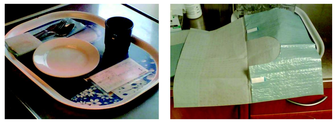
Photo collage 3. Existing solutions at Norwegian nursing homes.

In society in general, identity and individuality are strong drivers for choices in clothing as well as indoor products. The relations to social status, cultural boundaries and religious expressions support individual identity and consciousness of roots. Why would society wish to exclude these values and symbols in nursing homes?