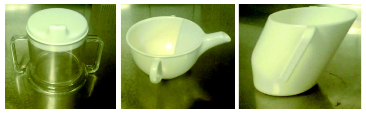
Photo collage 2. Existing solutions at nursing homes in Norway: cups for special needs.

Design of tableware that supports individual needs of use, however, is not stigmatizing to the user (Area A, dignified old age; Area D, individual experience).