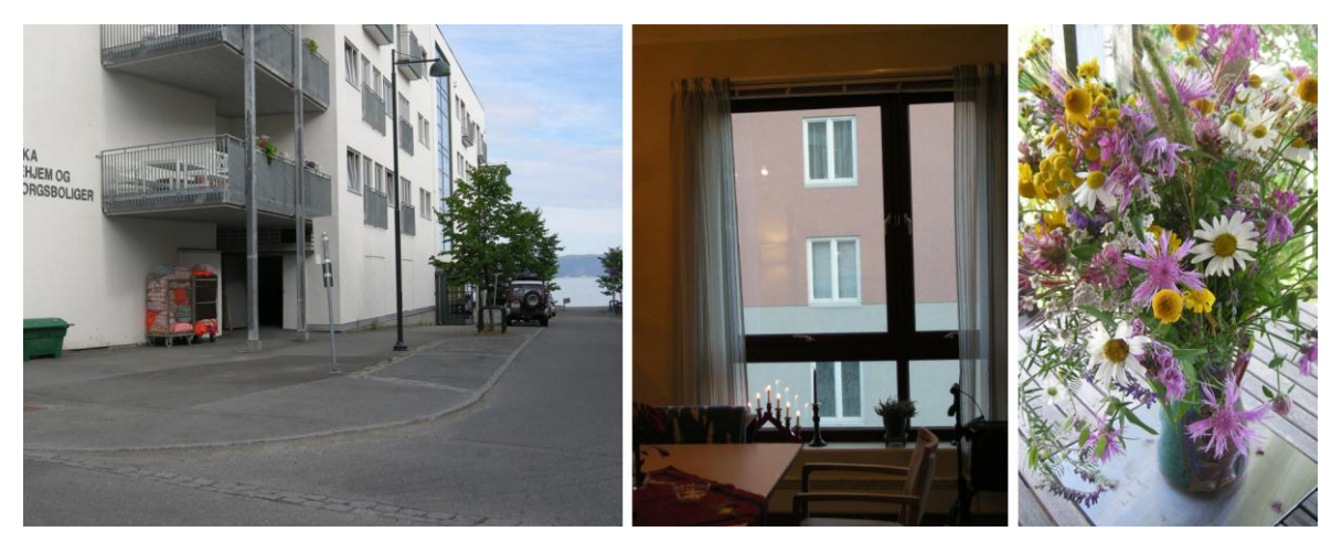
Photo collage 1. Existing solutions for many nursing homes today are taller buildings where the residents have little or no contact with outdoor seasons. Bringing the seasons into the dining room through natural elements and food of the season stimulates some of this basic relation.