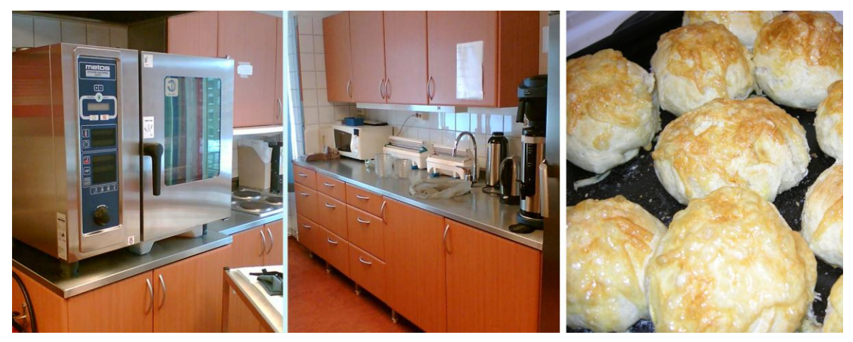
Photo collage 4. Existing kitchen solutions at most nursing homes have appropriate equipment that makes frequent baking activity possible.

This concept supports the vision "better than good enough." It should evoke memories as well as provide context for the elderly to have guests (Area D/1, 3, principles/criteria; Area A).