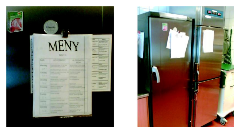
Photo collage 5. The existing situation at nursing homes today.