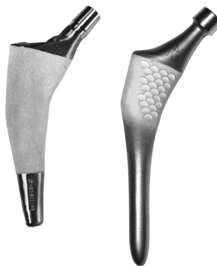
Figure 2. The implants. The Unique stem (left) and the ABG-I (right).

the study to maintain independence of data. Results from 87 patients were available for analysis; 78 of these patients completed the 5-year follow-up—35 patients in the ABG-I group and 43 patients in the Unique group.