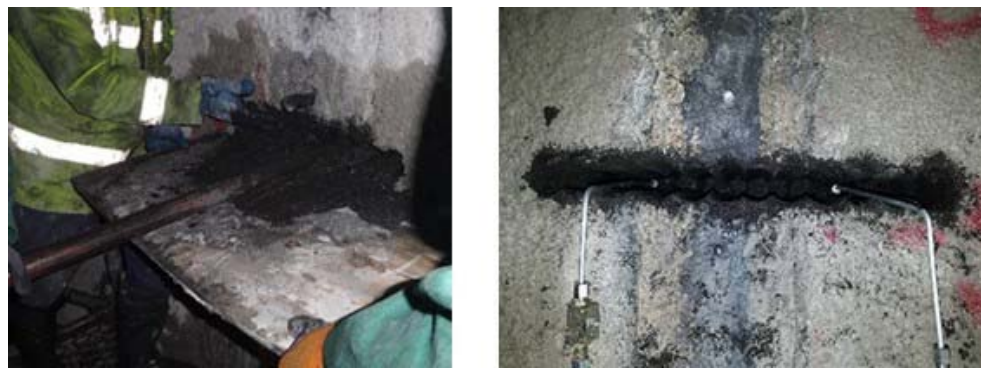
Figure 3. Installation of flatjack in the slot (left) and connection to the pressure measuring transducer (right).

The flatjacks were installed parallel to the tunnel radius and perpendicular to the circumferential stress. Due to flexibility issues with measurement pins, two of the flatjacks installed in the sprayed concrete lining, i.e. at headrace tunnel chainage Ch. 7+489L and Ch. 7+497R, respectively. Before installation, flatjacks were de-aired and coupled to dataloggers. The slots for the flatjacks were filled with a rapid hardening mortar and the flatjacks were then pushed into the mortar-filled slot. Mortar was further pushed to ensure the slot was completely filled and tightened (Fig. 3). The pressure measuring transducer were then connected to the flatjacks and set to start recording at an interval of 1 hour on filling and de-airing the flatjacks in order to determine the zero offset. The distances between the measurement pins were measured before and after the flatjacks were installed.