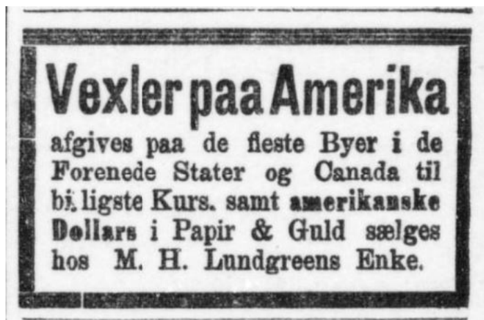
Figure 4 Exchange of currency

However, to be able to decide whether men or women were more impacted by chain migration it also has to be taken into consideration what reasons the migrants had for leaving Norway. In this part, the people who provided reasons linked to chain migration will be investigated. By doing so, this thesis will aim to discover the emigrants were impacted to