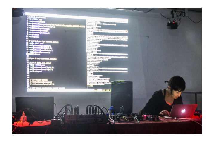
Figure 2: The first author live coding with MIRLCRep at Noiselets 2017, Freedonia, Barcelona, Spain (photograph by Helena Coll).

During a first round of development, which ended with a test-bed performance (Figure 2), the tool was used to query looping sounds from Freesound using tags and similarity. 16 The theme of the concert was noise music, thus the rehearsals and performance used sound samples related to the theme. In the rehearsals, the most used pattern by the live coder was to explore the online sound database by using tags related to the concert's theme (e.g., noise, hammer, cell-phone, digits, saw) and then retrieve other related sounds by similarity. Getting sounds by content was less used at this stage because the parameters were too long to type (e.g., .lowlevel.spectral_complexity.mean: or tonal.key_key:). Overall, the drawback of this approach was that there appeared unwanted sounds (e.g., a chord of a guitar), thus the serendipity became a disadvantage due to the uncontrolled random results. At the same time, the advantage was to know in advance what subspaces of the database were interesting without knowing a large heterogeneous database such as Freesound. The use of the similarity queries was found to give musically consistent results but with a certain level of unpredictability, which agrees with the literature on the difficulty of defining music similarity [14]. As areas of improvement, the search and retrieval processes could have been made more visible to both the audience and the live coder, in alignment with