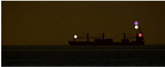
Figure 2: Should ships navigating in autonomous mode carry a special identification light? The behavior of the navigation AI

The assumption above is that if autonomous ships always follow COLREGS their behavior will be a hundred per cent predictable. But as we have seen above, this might not be true if e.g. the spectrometers onboard the autonomous ship does not interpret “restricted visibility” the same way we do (and therefore Rule 19 should or should not be used).