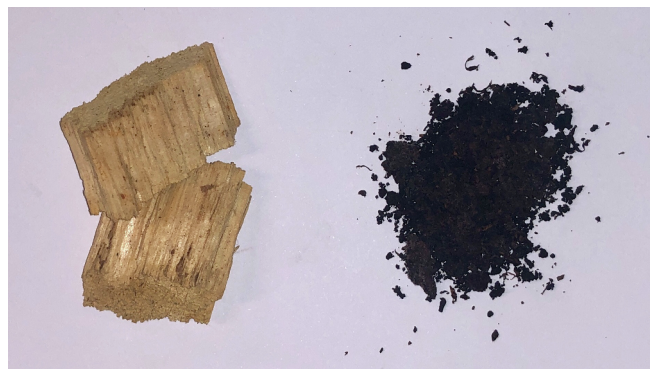
Fig. 1. Steam explosion treatment of birchwood. Birchwood chips of around 30 mm prior to steam explosion (A), compared to the dark and sticky birchwood with a less obvious fiber structure after steam explosion (B).

After the ultrasonication experiment was completed, \text{H}_2\text{O}_2 was added to the samples at the concentrations outlined in Table 1. This allowed the main Fenton-like reaction to take place within the sample. The samples were incubated for 2 h to undergo the Fenton-like reaction. BMP tests were then performed using these samples as the substrate. Fig. 2 display the amount of biogas obtained from each sample over time, while Table 2 displays the total biogas and methane produced after 35 days. The VFA content observed in these experiments is shown in Table 3.