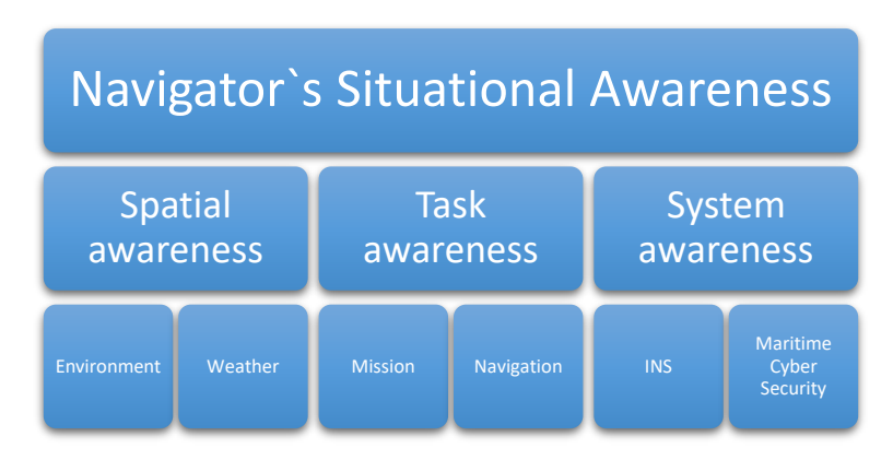
Figure 2: The relation between SA and system awareness.

Note that the bottom line of Figure 2 is meant as examples, and is not complementary as other examples could have been used. According to Endsley's theory, level three SA gives the person ability to project future states and events (Endsley, 1995). In a cyber-security context this will be the ability to; "anticipate, detect and respond to unforeseen situations (failures or attacks) before they can cause disruptions" (Alcaraz and Lopez, 2013, p. 31). While this might seem too much to expect of the navigator, we think that simple efforts focussing on understanding and comprehension of the cyber threat could help mitigate large portions of the contemporary cyber-attacks against an INS. With approximately 70% of breaches exploiting non-technical vulnerabilities (Deutscher et al., 2017), the navigator cannot afford to disengage in gaining cyber competence and leaving it to be the sole responsibility of the ICT department. Hence, there is currently a need to make the intangible cyber threat tangible, in order to add to the competence of the navigator instead of creating more confusion and uncertainty. "Preventing, identifying and defending against cyber-attacks requires educating, training and drilling staff, so as they can efficiently respond to attacks, spot errors and continue to operate under cyber-attack conditions" (Fitton et al., 2015).