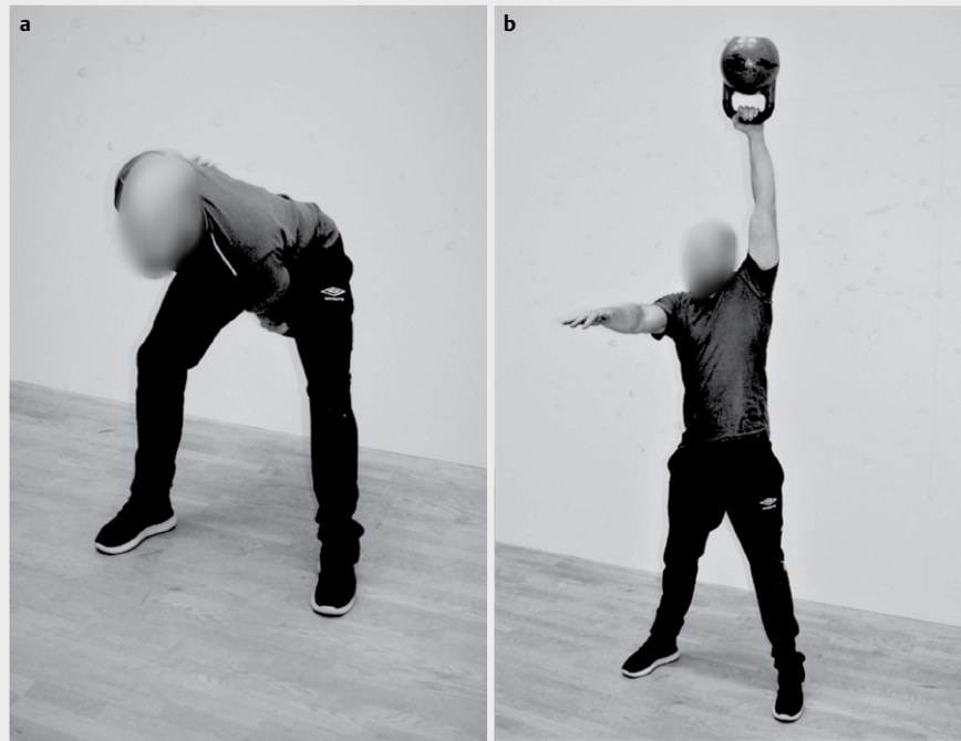
► Fig. 2 One-armed American kettlebell swing, lower a and upper b position.

movement and for the different phases. To check for systematic differences in swing time and range of motion between the exercises, a paired t-test was used. Statistical analyses were performed with SPSS version 22.0 (SPSS, Inc. Chicago, IL, USA).