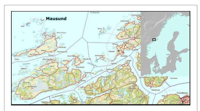
Figure 1: Mausund (63°N, 008°E), Frøya municipality in Sør-Trøndelag, Norway

Nine {\it L. hyperborea} individuals, for a total of forty-eight samples, we recollected at Mausund during 2012–2015. The concentrations of the ten elements Cd, Hg, Pb, Al, Cr, Fe, Ni, Cu, Zn and As are given in \mug/gdry weight.