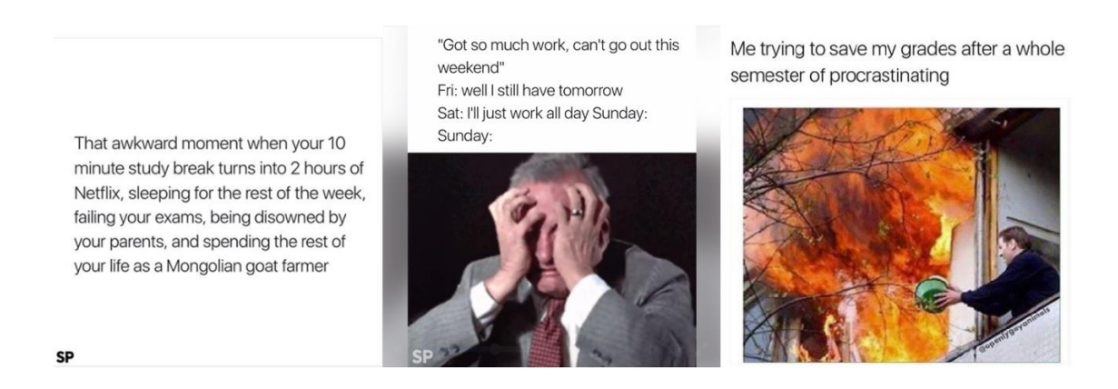
Figure 3: Examples of posts theming procrastination.

While procrastination is defined as the voluntary delay of due tasks (indicating that there are no external forces or seemingly rational reasons for postponing) the SP Memes speak to an experience where delays happen for seemingly no reason and are beyond their control. The posts alternate between 1) relatable moments of delays getting out of hand; 2) descriptions of powerlessness as the procrastination continues; and 3) the consequences that follow from procrastination. All three are present in the meme on the left (Figure 3): "That awkward moment when your 10 minute study break turns into 2 hours of Netflix, sleeping for the rest of the week, failing your exams, being disowned by your parents, and spending the rest of your life as a Mongolian goat farmer". Not only does the meme describe a gradual decent from safe leisure to feared future, it also makes a direct and causal link between failing to study, being socially shamed (disowned by family), and having poor career prospects (goat farming). The sense of futility that procrastination may bring is illustrated in the image on the right (Figure 3) where studying for exams after a semester of procrastination is equated with throwing a single bucket of water on a massive fire.