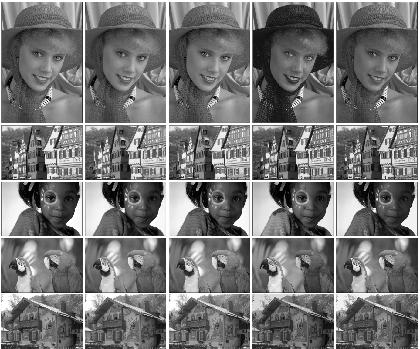
Fig. 2. Resulting greyscale images for the Kodak test images shown in Figure 1. Left to right: CIELAB L^* , \Delta E_{00} , \Delta E_{99} , Du, and Smith.