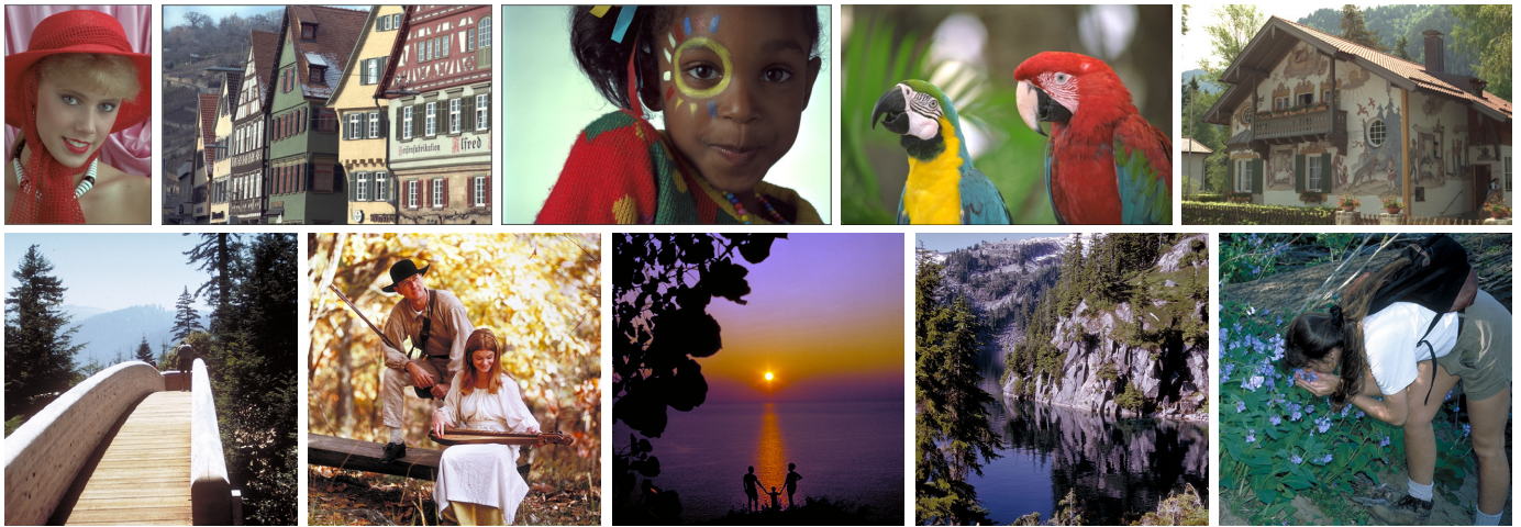
Fig. 1. Images used for the psychometric experiment. The images in the top row are from from CSIQ and the images in the bottom row are from the Kodak data set.