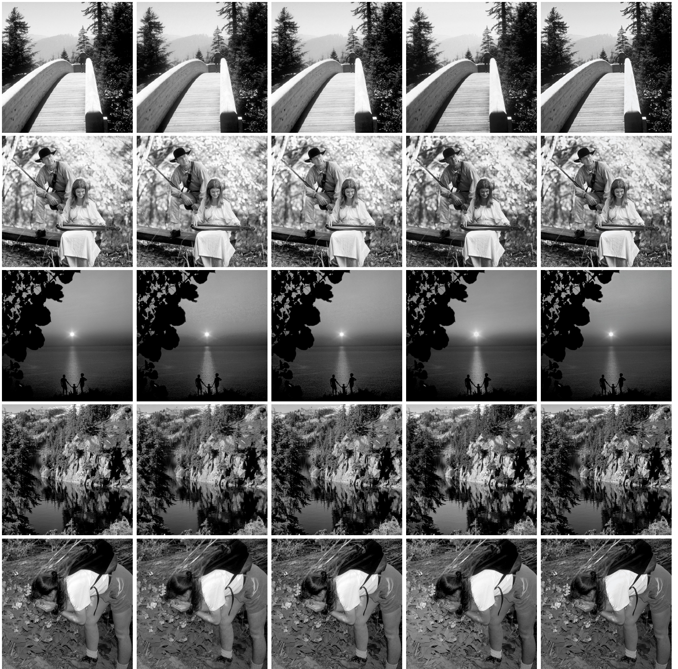
Fig. 3. Resulting greyscale images for the CSIQ test images shown in Figure 1. Left to right: CIELAB L^* , \Delta E_{00} , \Delta E_{99} , Du, and Smith.