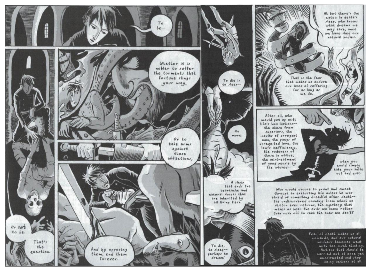
Illustration 4: To be or not to be (Babra, 2008, pp. 80-81)