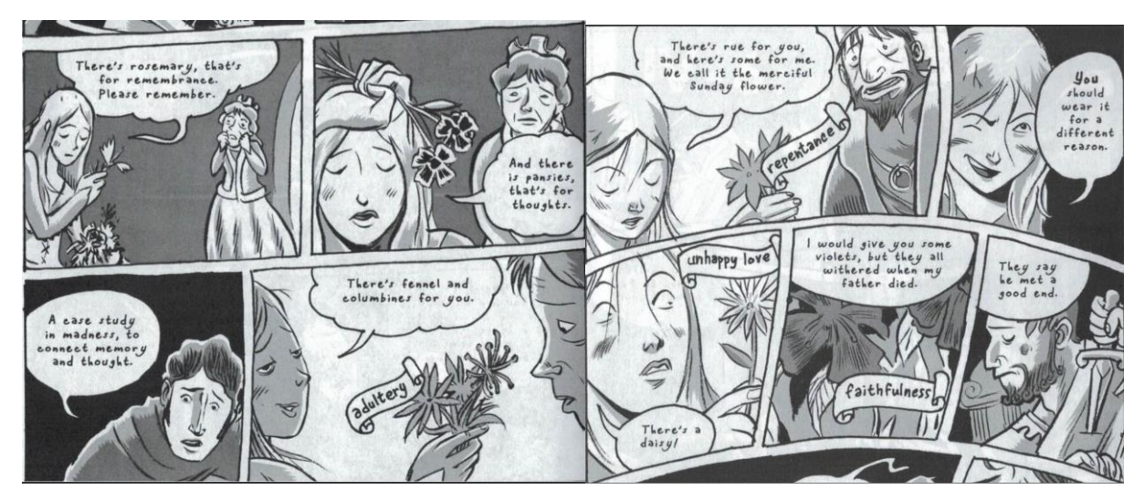
Illustration 6: Ophelia's flowers (Babra, 2008, pp. 150-151)

One of the most obvious example of information that most first time reader will not have the ability to understand (unless specifically schooled in the art of floriography) is in act IV, scene V, when Ophelia hands out flowers with specific meanings. We are told what the first few mean, which might inspire a motivated reader to look up the meaning of the rest, but will might not spark that kind of interest in a other readers. Shakespeare's contemporary audience might have had a greater likelihood of knowing what the flowers implied, as it was possibly more common in Shakespearean time to send messages in such a way than it is now. Without being told what the subsequent flowers represent, most contemporary reader would then lack the insight into Ophelia's character that they would get if they knew. Babra solves this challenge by placing labels on top of the flowers, revealing the meaning each flower carries. Coupling this with the expression on Ophelia's face after giving the king rue, one also senses that she knows more than she is letting on. This is an example of common debates surrounding Hamlet; is Hamlet genuinely mad, does Ophelia know what the new king has done, as well as others. These debates are not a part of this thesis, but the fact that Babra has incorporated illustrations that allude to the questions often asked in academic settings is very fascinating, and will be discussed later in this chapter.