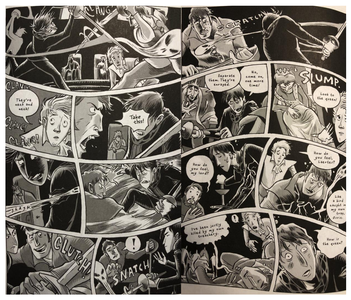
Illustration 8: The Fight Scene (Babra, 2008, pp. 197-198)