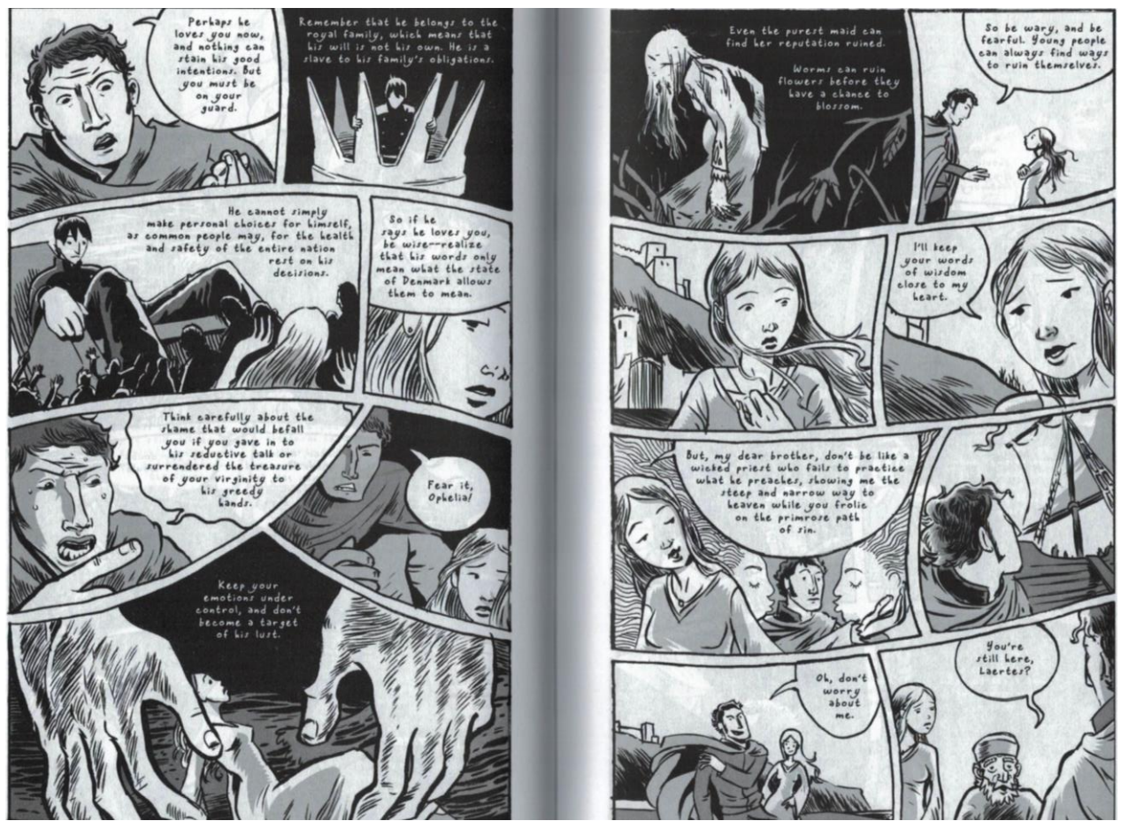
Illustration 2: Laertes warning Ophelia about Hamlet's intentions (Babra, 2008, pp. 24-25)