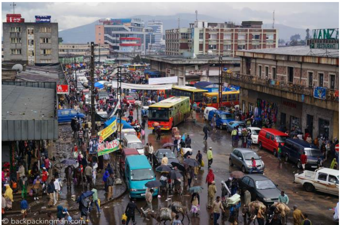
Merkato (Backpackingman, 2013)

A broker is a person who functions as an agent or intermediary between two or more parties in negotiating agreements, in return for a commission (Collins Dictionary, 2011). Broker house “Delala bet” means a house where brokers are located.