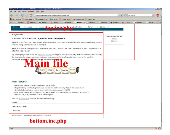
Figure 7.2: The design split into separate files

major ones are: login, logout, create user, and create project. The consequence of this is that to all these existing functions in the system there have to be able to run hooks from external entities that handle the functionality for the tools. This is done by creating functions that can be called dynamically. These functions are implemented in an controller for every tool.