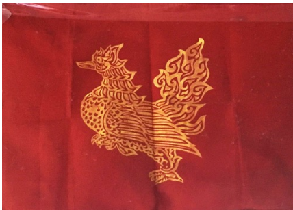
Mon Flag with Mon symbol (Mon bird).