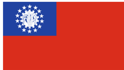
Burma Flag with Burmese Symbol.