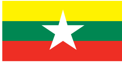
Myanmar Flag.