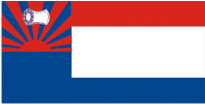
Karen Flag with Karen ethnic symbol (buffalo horn).