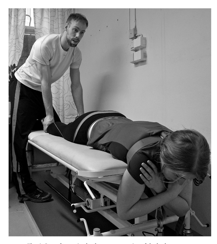
Fig. 4. Setup for maximal voluntary contraction of the back extensors.

Handgrip strength (Fig. 5) of the dominant hand is assessed using a hand dynamometer (JAMAR hydraulic hand dynamometer, model J00105). The second narrowest handle position will be used [42]. During testing, subjects sit on a stool with their back against the wall, the upper arm hanging down alongside the body and a 90° flexion in the elbow. Subjects are instructed to squeeze the dynamometer as hard as possible and continue to squeeze until the force starts to decline. Two tests are performed with 1-min rest intervals. A third test is performed if the second test is < 10% different from the first test. The highest value will be used in the analysis.