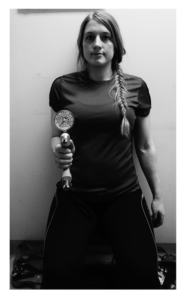
Fig. 5. Setup for the grip strength test.