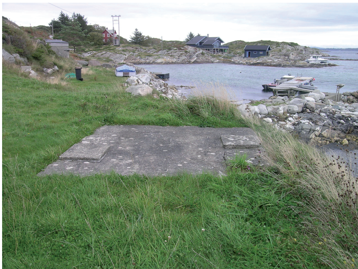
Figure 4. At least eight localities of P. obtusata are threatened by habitat loss due to construction work, like here at Litla Kalsøy in Austevoll, Hordaland. (Photo J. B. Jordal).

Two of the 34 localities were destroyed due to fertilization by use of wet manure, and building of houses. At