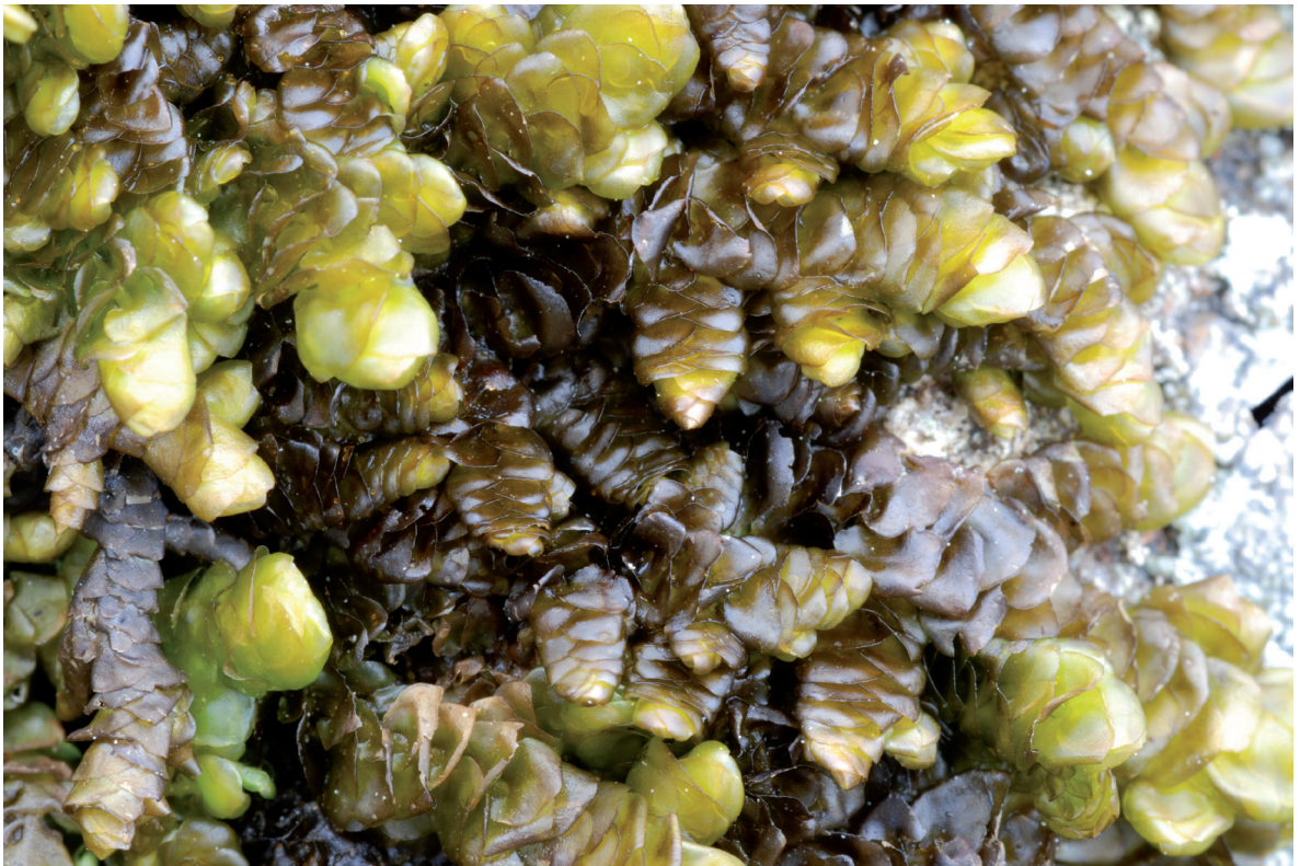
Figure 1. Porella obtusata growing in yellowish green glossy patches with a characteristic secondary brownish pigmentation. (Photo: J. B. Jordal).

Collections of Porella obtusata in Norwegian herbaria were examined by the first author. Both old and new collections and field notes are available at “Artskart” (Artsdatabanken and GBIF 2015). During recent years, the species has been systematically searched for in areas where it could be expected to grow. This field work has been conducted in important areas for nature management and partly on contract for the management authorities. In particular we have searched for P. obtusata in areas with calcareous or other base-rich bedrocks close to the sea in the oceanic southwestern districts of the counties Rogaland and Hordaland. Geographic coordinates of all registered populations were taken with handheld GPS with an accuracy of \pm 10 m. Notes on habitat, substrate and altitude were made at each locality. Associated species were registered at some localities. Collections from new localities are deposited in public herbaria, mainly TRH.