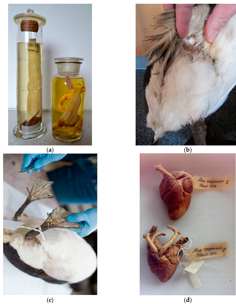
Figure 3. (a) Jars containing the oesophagus from the last two individuals killed on Eldey Island. The oesophagus from the larger jar represents that of the individual labelled male (NHMD153069) (MK131). The smaller jar contains the oesophagus from the female bird (NHMD153070) (MK132). (b) Sampling of The Oldenburg Auk (AVE 8086) (MK133) to remove a section of body tissue for DNA extraction. (c) Sampling the toe pad of The Bremen Auk (RKNr. 2392) (MK134) to remove tissue sample. (d) The hearts from the last two documented individuals. The heart from the female individual has been sampled for this study (top) (NHMD153070) (LastGA2_Heart).

Genomic DNA was extracted from the oesophagus (Figure 3a), skin (Figure 3b), toepad tissue (Figure 3c), and feathers using a modified version of Dabney et al. [14] in which the initial digestion was carried out following the protocol by Gilbert et al. [15]. This digestion buffer is better suited to extraction from these tissues types than the Dabney et al. [14] digestion buffer, which was optimised for DNA extraction from bone. Subsequent DNA purification and elution was conducted following the approach described by Dabney et al. [14]. Genomic DNA was extracted from the heart tissue (Figure 3d) using the protocol by Campos et al. [16].