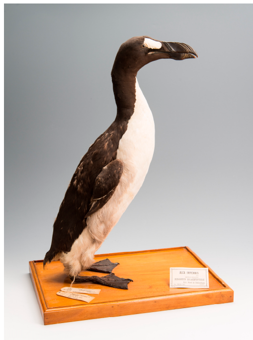
Figure 1. A mounted Great Auk skin, The Brussels Auk (RBINS 5355) (MK135), from the collections at Royal Belgian Institute of Natural Sciences.

The Great Auk (Figure 1), Pinguinus impennis , Bonnaterre (1790) (traditionally Alca impennis , Linnaeus, 1758), has been described as “perhaps the most curious of all vanished birds” [3]. It was a bird whose life and ultimate extinction has generated ongoing interest, with several scholars dedicating their lives to Great Auk research [3–7]. Even now, 173 years after the death of the last two recorded captured individuals, there are still many unanswered questions concerning aspect of its life-history, evolution, and extinction. One such mystery that surrounds the Great Auk is the whereabouts of the skins from the last documented pair. In order to be able to correlate the phenotype of the last birds with genomic information obtained from the well-preserved organs, and in view of the active role that researchers and research institutions played in pushing the Great Auk towards extinction, it is of relevance to be able to trace these skins.