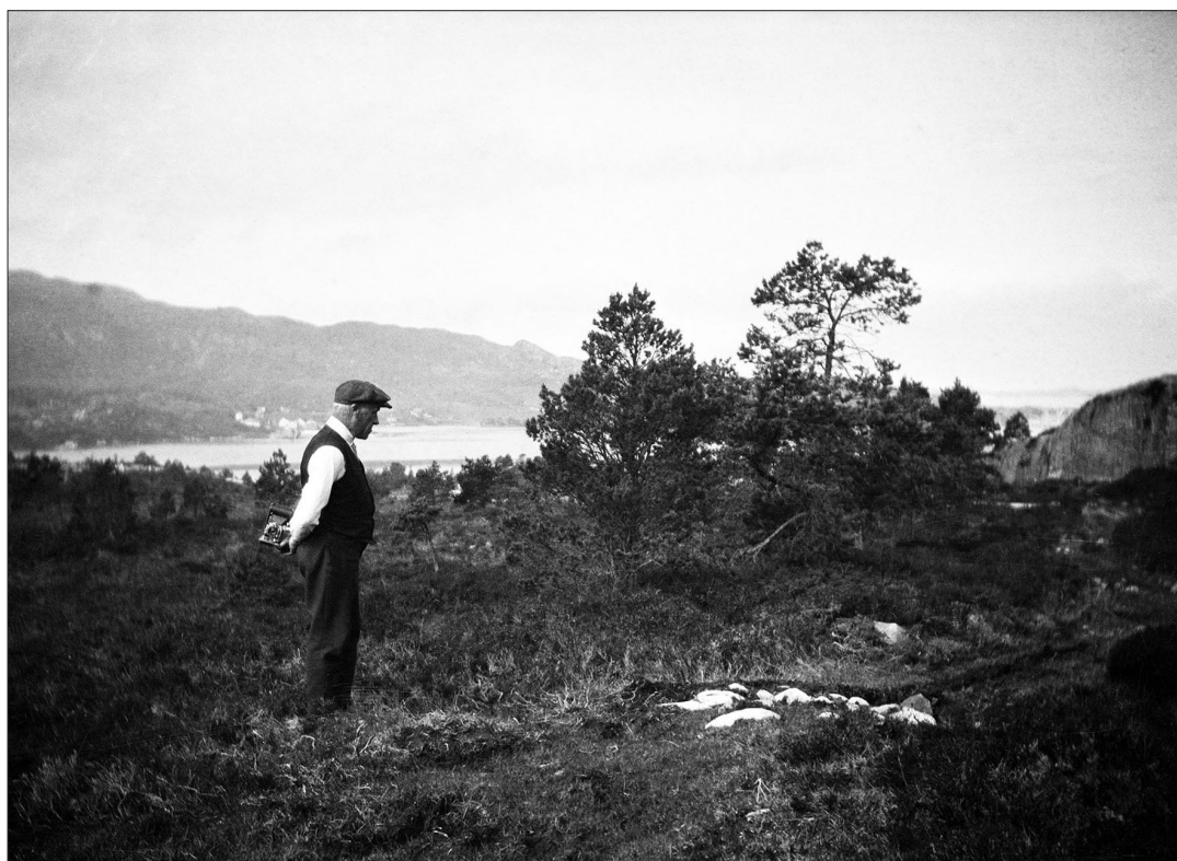
Fig. 4: Nummedal at an excavation in Frei, Kristiansund, Norway.

would be most willing to, however, if the museum cannot find a man for the task at this time of year (Nummedal 1910a: 1–2; authors' translation).