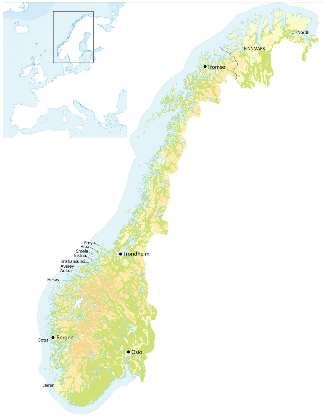
Fig. 1: Map of Norway displaying place names mentioned in the text: by the authors.

Kristiansund (see Figure 1 ) in Central Norway. In 1909 he found two pieces of flint that had, possibly, been worked by prehistoric humans. The artefacts themselves were quite ordinary and chronologically insignificant, but for Nummedal they were the key to finding traces of the earliest settlements along the Norwegian coast.