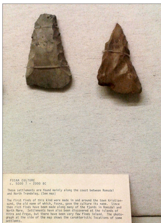
Fig. 6: The plaque in the NTNU University Museum in Trondheim still reads: 'Fosna Culture, ca. 5000? – 2000 BC', as some kind of silent opposition to Nummedal's dating efforts.

his geological experience he recognized several topographical features related to the sites that he interpreted as cultural preferences: the settlements were located close to the current water margin and good natural harbours, in open terrain but protected from the prevailing winds. Following this set of presumptions as settlement preconditions, he used them to search systematically for new archaeological sites. Thanks to continued surveys during the last decades we now know hundreds of sites from the post-glacial colonization phase in Norway (Breivik In prep.), and the characters of these sites generally seem to be in line with Nummedal's ideas (i.e. Odner 1964; Møllenhuis 1977a; Schanche 1988; Bjerck 1989, 1990; Bergsvik 1991, 1995; Bang-Andersen 1996; Barlindhaug 1996; Svendsen 2007; Johannessen 2009; Westli 2009; Nyland 2012).