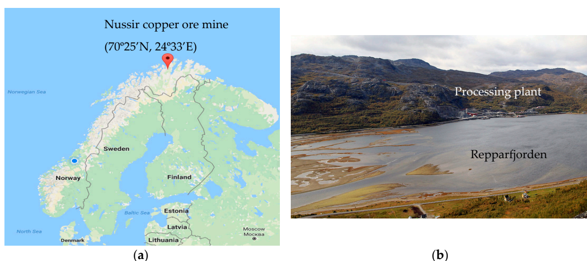
Figure 2. (a) Location of the Nussir copper ore mine on Google Map; and (b) a natural landscape view of the Nussir mineral processing plant adjacent to Repparfjorden, northern Norway.

This case study aims to identify the contributions of local emissions to the LCIA results at both midpoint (environmental problems-oriented) and endpoint (damage-oriented) levels. A cradle-to-gate LCA was carried out, beginning with raw material and energy production and ending with copper concentrate ready for delivery. To investigate the relative contribution of emissions from transport of copper concentrate, we included shipping from Port Hammerfest to Port Rotterdam (with a distance of around 2500 km) in this study, assuming that half of the total emissions from shipping was released in the Arctic region. The functional unit assumed for this study was 1 kg of copper in copper concentrate. The produced copper concentrate at this mine contains approximately 45% copper and a small amount of silver and gold. The allocation of environmental burdens between the product and co-products (i.e., copper, silver and gold in copper concentrate) was based on their economic values, namely copper 82.8%, silver 11.6%, and gold 5.6%.