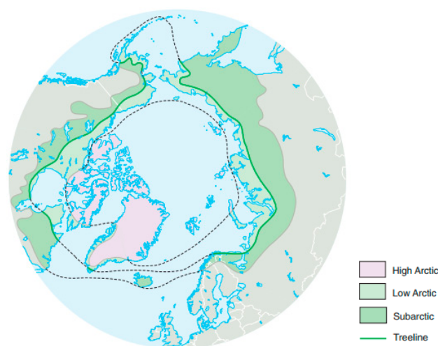
Figure 1. Arctic and subarctic floristic boundary to delimit the terrestrial Arctic by the treeline [29].

A common definition of the Arctic is the area north of the Arctic Circle ( 66^{\circ}32' N ), approximately outlining the southern boundary of the midnight sun. Alternative definitions are based on temperature (the area north of the 10^{\circ}C July isotherm), vegetation or oceanographic characteristics, while Arctic Monitoring and Assessment Programme (AMAP) applies a geographical compromise (Figure 1) delimited by the treeline (trees not growing beyond the northern limit) [29].