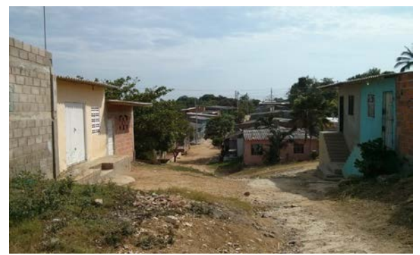
Picture 4. Siete de Abril is one of many informal settlements in Barranquilla inhabited largely by IDPs.

Serious complaints relate to the poor location (often outside of the built area of the city), overcrowding, use of cheap and prefabricated materials, lack of quality public spaces and commercial uses, as well as inadequate provision of health centers and police stations (Correra et al., 2014).