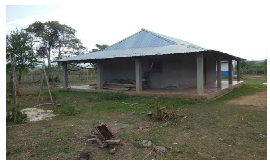
Picture 3. Vacant farm in El Carmen de Bolívar. It was restituted to the original owner, but he did not want to return there and take up farming again.