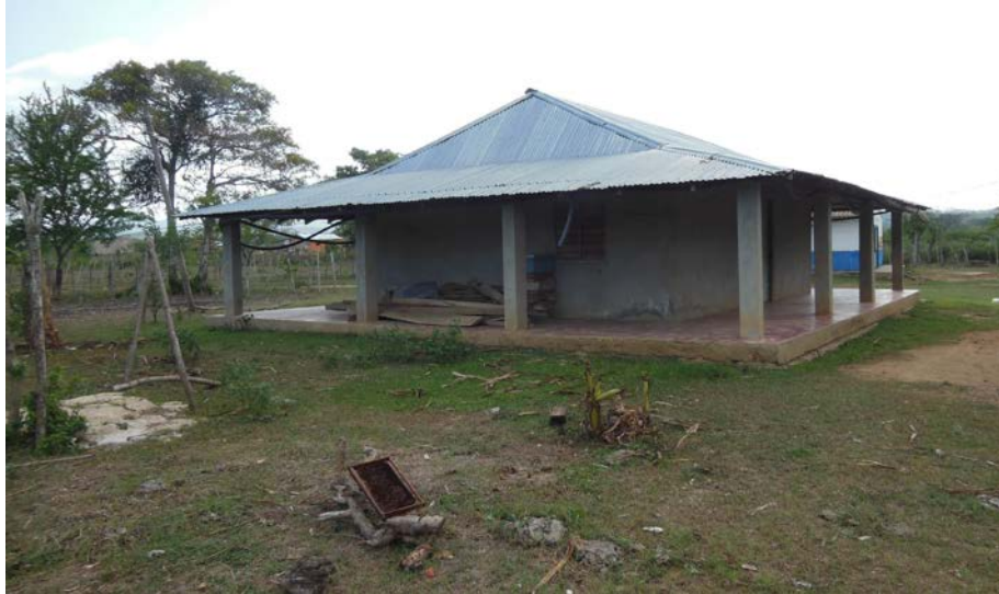
Picture 3. Vacant farm in El Carmen de Bolívar. It was restituted to the original owner, but he did not want to return there and take up farming again.