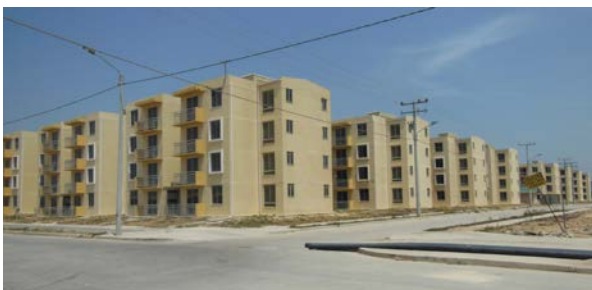
Picture 1. Villas de San Pablo housing project

We conducted in-depth interviews with ten IDP households, of which four live in the apartment block housing project Villas de San Pablo (Picture 1) 10 in Barranquilla, four in the single-story housing project Nueva Esperanza (Picture 2) 11 in the neighboring city of Soledad, and two who are still on the waiting list. They confirm that return to the place of origin is not the preferred alternative. All of the beneficiaries expressed their satisfaction at having obtained a house or apartment free of charge, and declared their willingness to settle there permanently. Only two of the interviewed households are in the process of Land Restitution, but they have no intention of returning and say they will sell the restituted property as soon as possible. In other cases, the interviewed IDPs are either not entitled to restitution, because their areas of origin are not yet eligible for restitution, or they have not bothered to apply as they do not believe the process works in a truly transparent and timely, efficient manner. Still, all interviewees indicated that they missed some aspects of living in rural areas, such as being able to grow or produce their own food. For this reason, two respondents said they would consider moving to the countryside—not to the same area where they came from, but somewhere else.