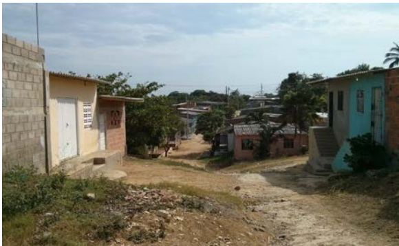
Picture 4. Siete de Abril is one of many informal settlements in Barranquilla inhabited largely by IDPs.

Serious complaints relate to the poor location (often outside of the built area of the city), overcrowding, use of cheap and prefabricated materials, lack of quality public spaces and commercial uses, as well as inadequate provision of health centers and police stations (Correra et al., 2014).