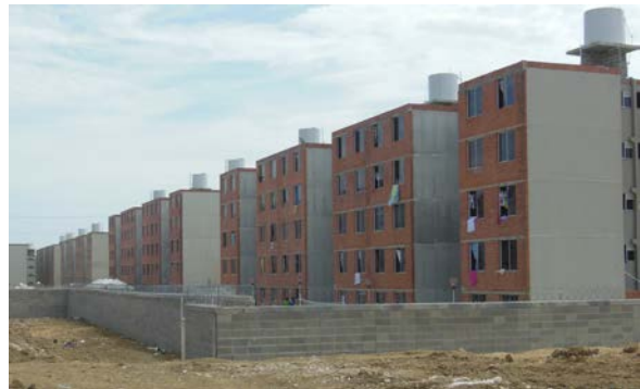
Picture 5. Las Gardenias Free Housing project in Barranquilla.

Insecurity might become a growing problem in the new Free Housing projects in the future, as an increasing number of crime, activity of local street gangs, acts of vandalism, stealing and consumption of drugs in common spaces are reported (El Heraldo, 2015). Lack of ownership and insufficient funds for housing improvement lead to a rapid deterioration of private and common areas, highly evident during our field visits. The local media have also reported how many of the projects might quickly be turning into ghettos and isolated pockets of poverty (Correra et al., 2014; El Heraldo, 2015; Semana, 2015b).