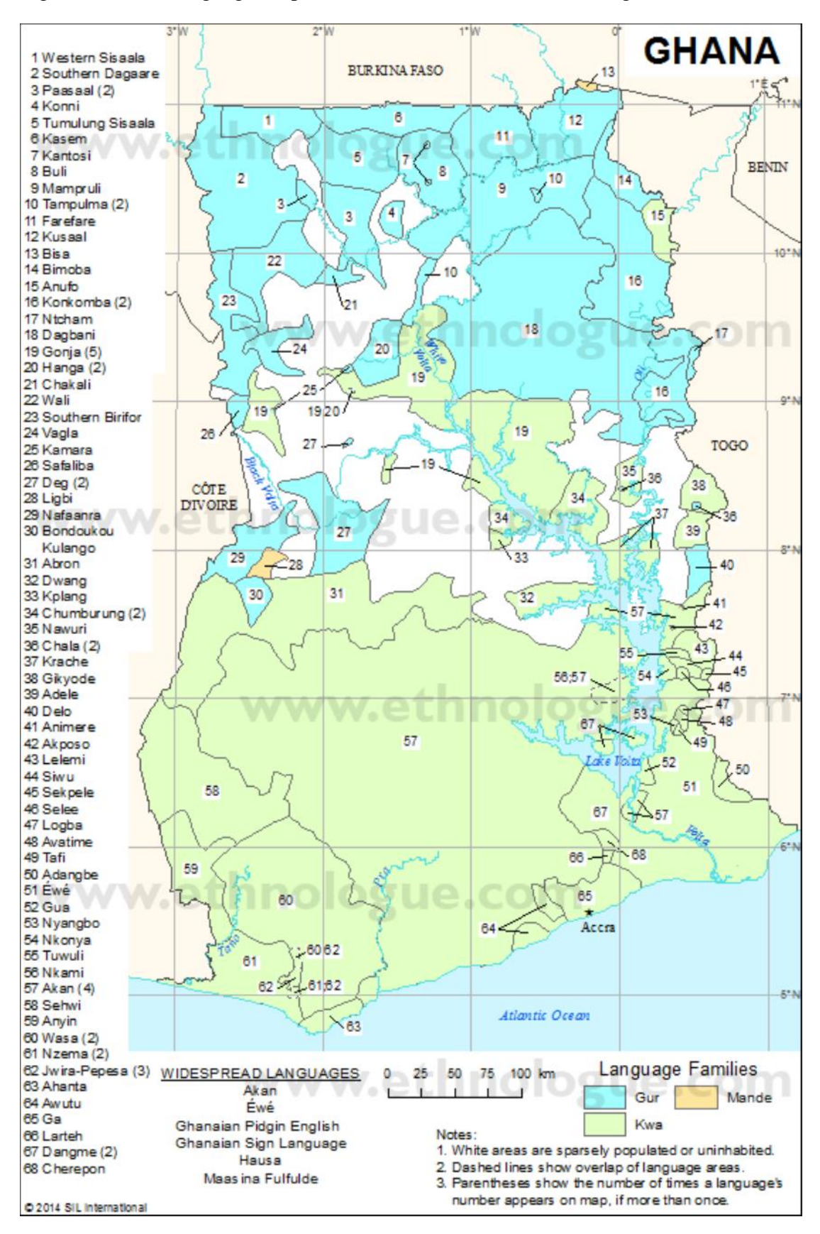
Figure 1.1: The Language Map of Ghana (Lewis, Simons & Fennig, 2015)