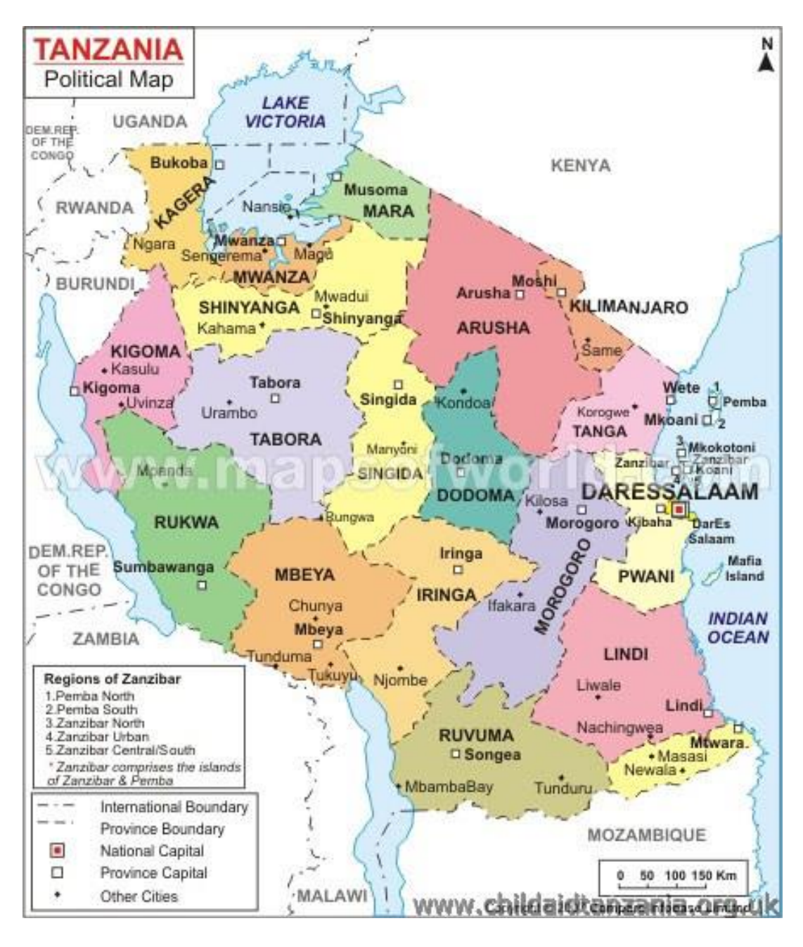
The Map of Tanzania showing regions including Tanga region where I conducted my study