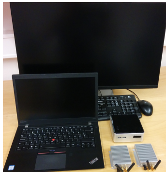
Figure 2: Experimental Hardware (excluding UEs)

User Equipment. We used a Samsung Galaxy S4 device to find the LTE channels and TACs used in the targeted area. For testing the IMSI Catcher, we used two LG Nexus 5X phones running Android v6. We used different USIMs