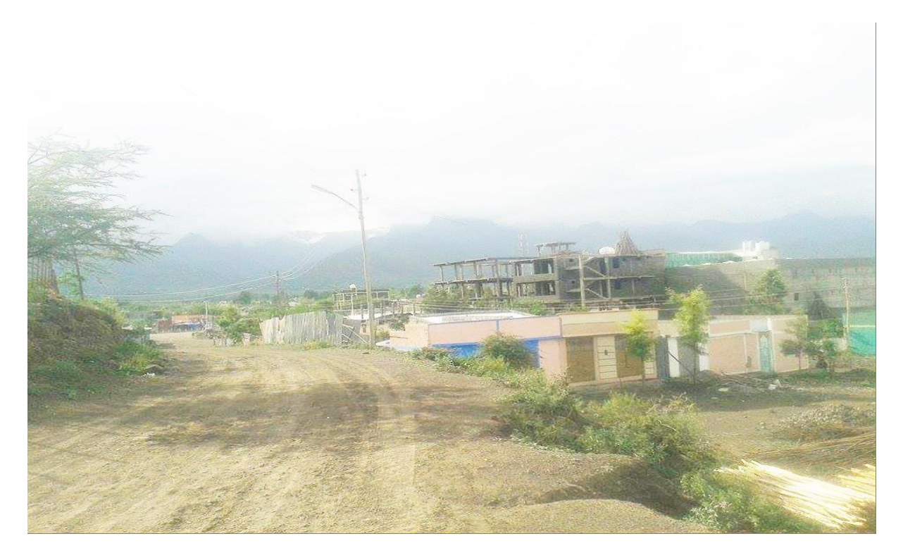
Figure 4.2. Partial image of the town from distance

Many youths like Abebe left their school and migrated to the Middle East. Their migration has many implications for the local community. At first, as you can understand from the above case presented by Abebe, migration has economic and family related motives for youth migration to the Middle East.