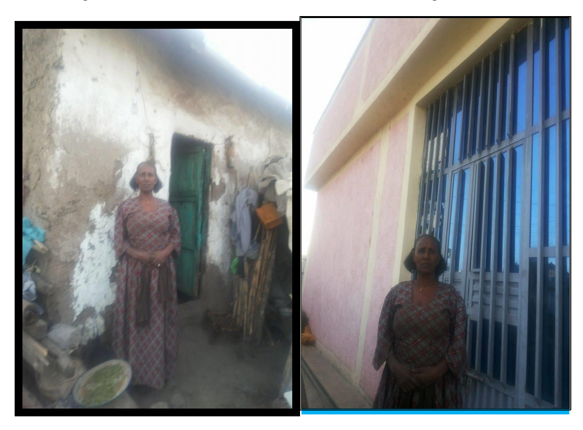
Figure 5. New Corporate Establishment<sup>11</sup>