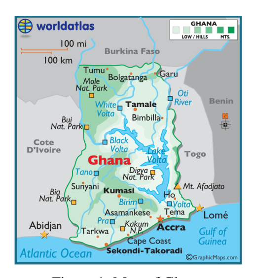
Figure 1: Map of Ghana

In terms of education, the proportion of children aged three years and above who have never is for 23.4% whiles the proportion of those in school is 76.6%. The proportion of children in the rural areas is 33.1% and it is more than two times that of children in then urban areas which is 14.2%. This implies that more children in the rural areas are uneducated (GSS, 2013). A number of policies have been implemented since the early 1950's to increase access and quality to all levels of education nonetheless there are still some challenges to improve quality at the basic level, issues of disparity and inequity among the poor and marginalised groups. In this regard even middle poor households are opting for private sector education if they can afford (Akyeampong et al., 2007, p. 1).