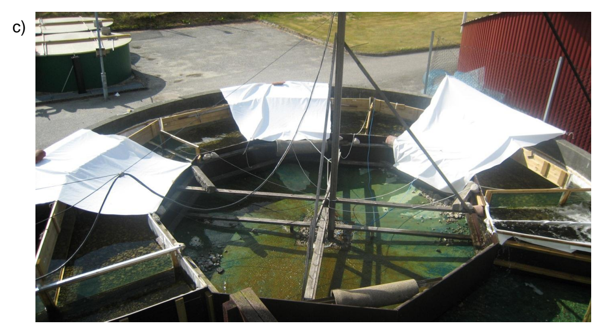
Fig. 1. Illustrations/photos of experimental stream channels showing (a) schematic drawing where water from the water inlet flows counter-clockwise towards the water outlet. All sections (1-3) have the same total area (10 \text{ m}^2) , (b) sloped river bed creating deep/shallow habitat. A "curtain" for separating the two habitats is held in place by metal pins attached to ropes. The curtain is let down by pulling the ropes. (c) three sections of a single arena, where half of the total area of each section is covered by a white plastic tarp, creating overhead shelter and shadow from the sun. Ropes attached to curtains for separating the habitats can be seen attached to the centre of the stream channel.

To determine juvenile habitat choice (deep/shallow), it was possible to separate the shallow/deep habitats using an escape proof wooden "curtain" (Fig. 1b). A curtain was closed by pulling 2 ropes attached to it, thus sliding it into a frame extending well above the water line. This made it impossible for fish to cross between the two habitats.