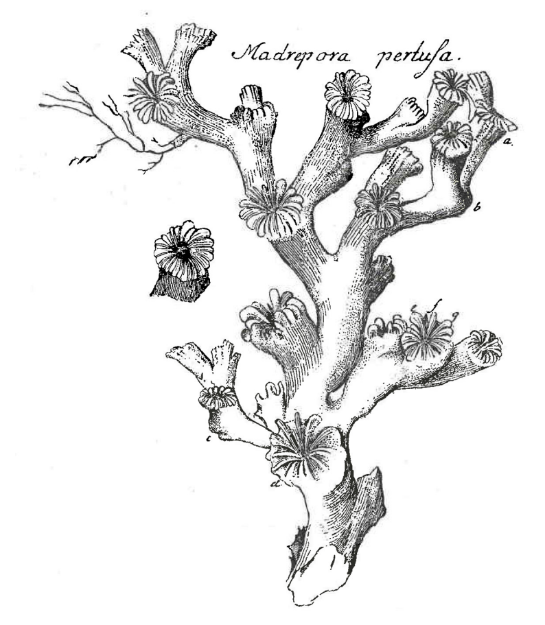
Figure 1: Lophelia pertusa , the reef-building cold-water coral common in Norwegian waters. This illustration was published by Gunnerus (1768) and was the first illustration of this species. The illustration has become iconic due to its high quality. From Gunnerus 1768.

Several papers published by Gunnerus dealt with species of fish. He had good access to some species of sharks and the Chimera ( Chimera monstrosa ). A modern description would require more specific details on certain morphological characteristics, but what Gunnerus wrote is still an important primary source. Anatomy in general and reproductive traits in particular was presented to science for the first time. Both Nordgaard (1918) and Sivertsen (1961) emphasised Gunnerus's important contribution to the life history of these species.