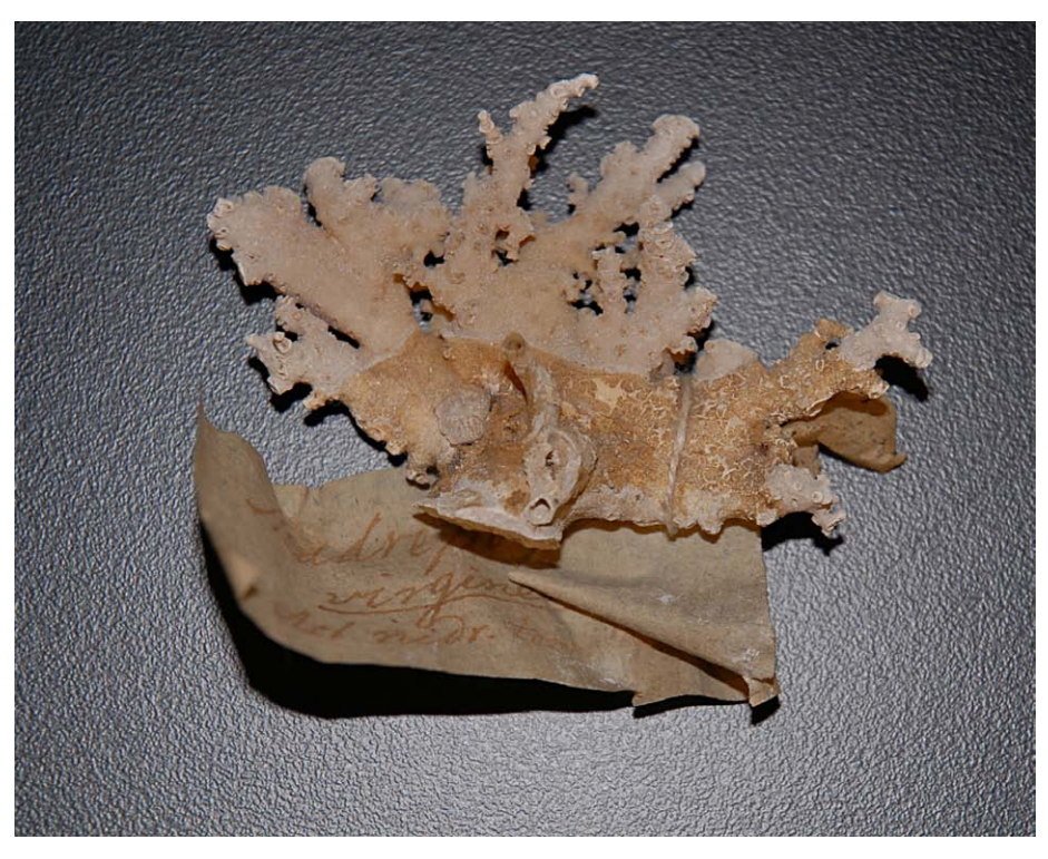
Figure 2: The original specimen of Stylaster norvegicus , with original label.

Other specimens of the same species may be represented in the collection, but neither labels (no original labels exist) nor studies published by specialists (Broch 1914; Zibrowius & Cairns 2005) indicate this.