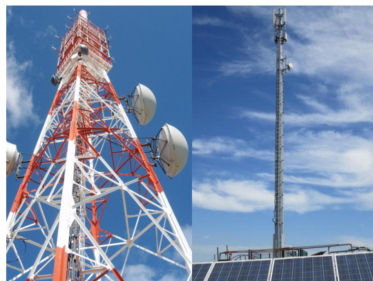
Fig. 1. Antennas mounted on a lattice tower (on the left), antennas mounted on a monopole (on the right).

Standards are a very important part of engineering practices, serving as rules that engineers must comply. Structural design