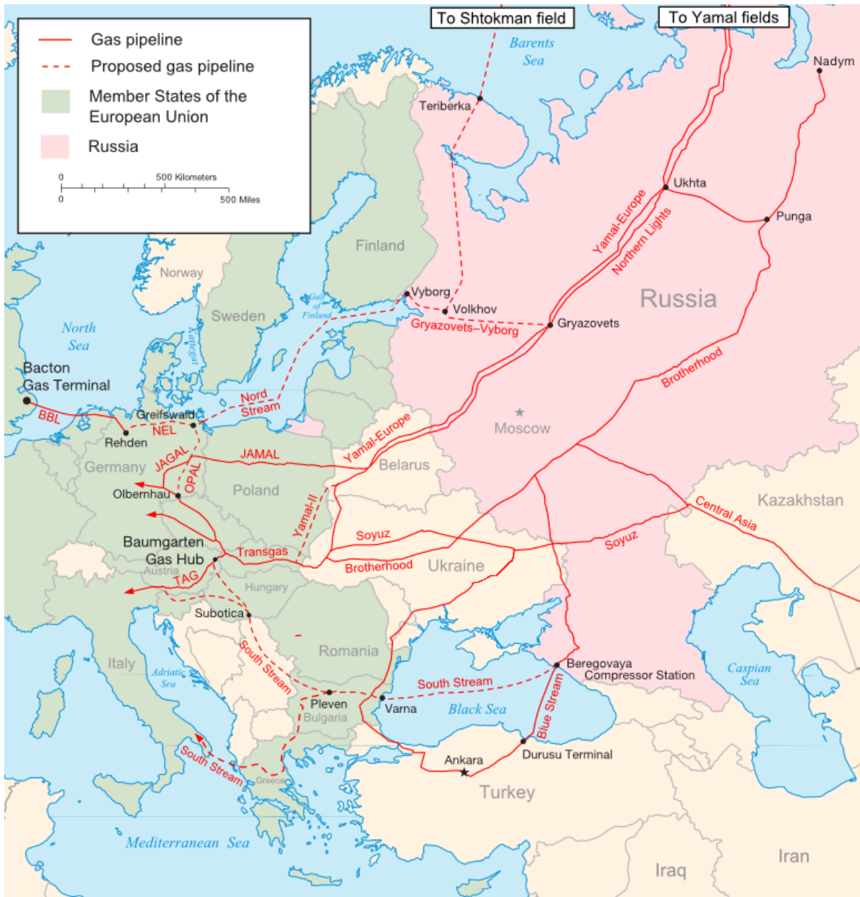
Figure 4 Major Russian pipelines to Europe (Bailey, 2009)