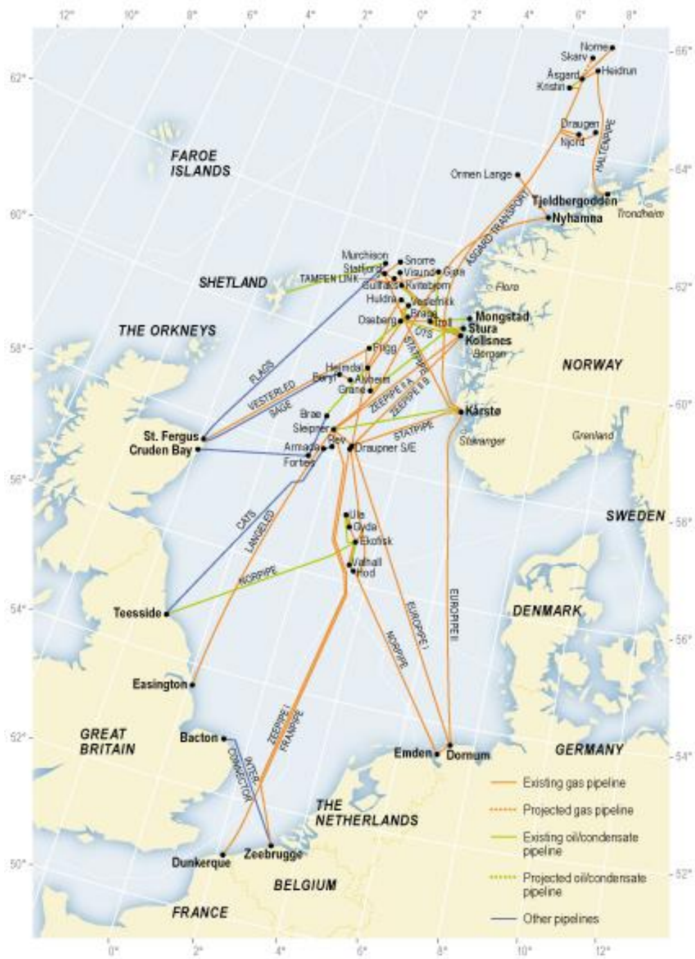
Figure 1 Norwegian gas infrastructure. Existing and projected pipelines (Norwegian Petroleum Directorate, 2010)