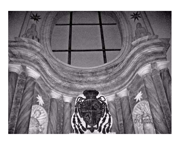
Fig 3, San Giovanni in Laterano, Funerary monument for Cardinal Acquaviva.

from the vertical front plane to a plane at some 15 degrees to that. Thus the architrave represents a spatial shape of high complexity.