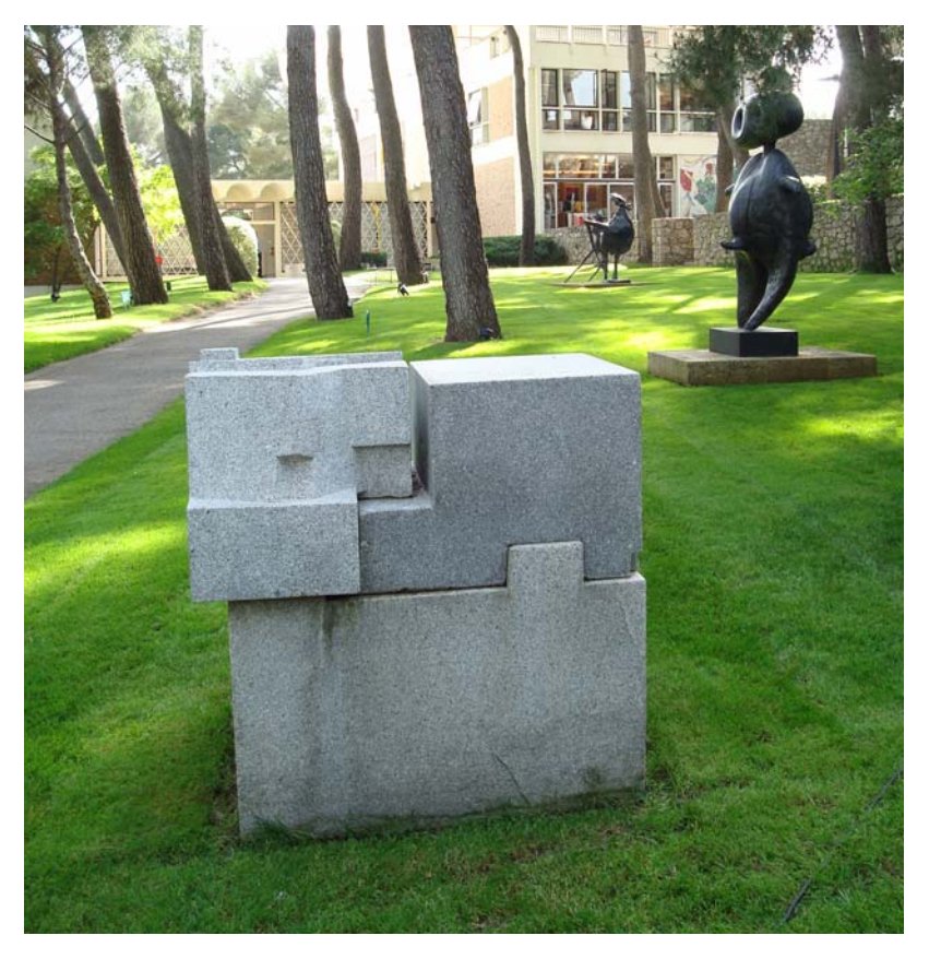
Fig. 1. Eduardo Chillida, Sculpture (Coll. Maeght, St.-Paul-de-Vence).

To lend some more substance to the above points, which touch directly on the distinction shape/form , let us have a look at a scultpure that, with its complex structure of simple forms and with its exposure to public view, shows essential characteristics of buildings: Eduardo Chillida's block sculpture.