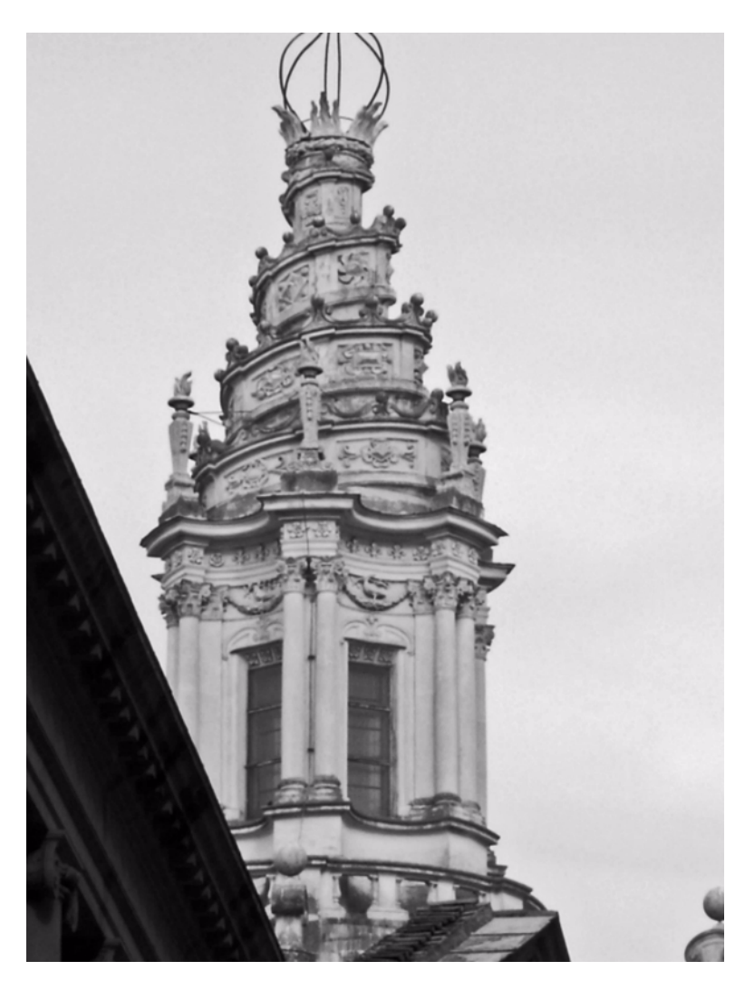
Fig. 4. Rome, Sant'Ivo alla Sapienza, spire seen from the present Via del Teatro Valle.

from a spiral (a flat curve); but this is constructed n ot in generative math but by setting up a series of definite points (Sl, Patterns and programs , 1.9).