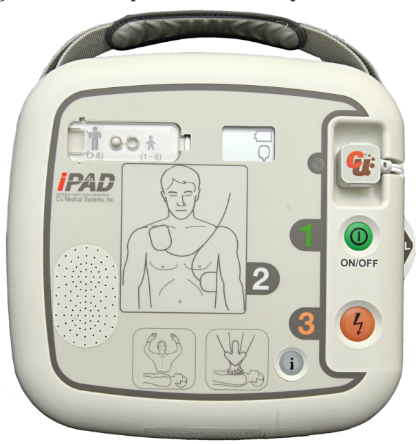
Figure 1.1: AED

available to most people. Most importantly however, these drones are able to automatically navigate to a GPS coordinate, and move at considerable speed. They are also able to bring a few kilos of payload with them.