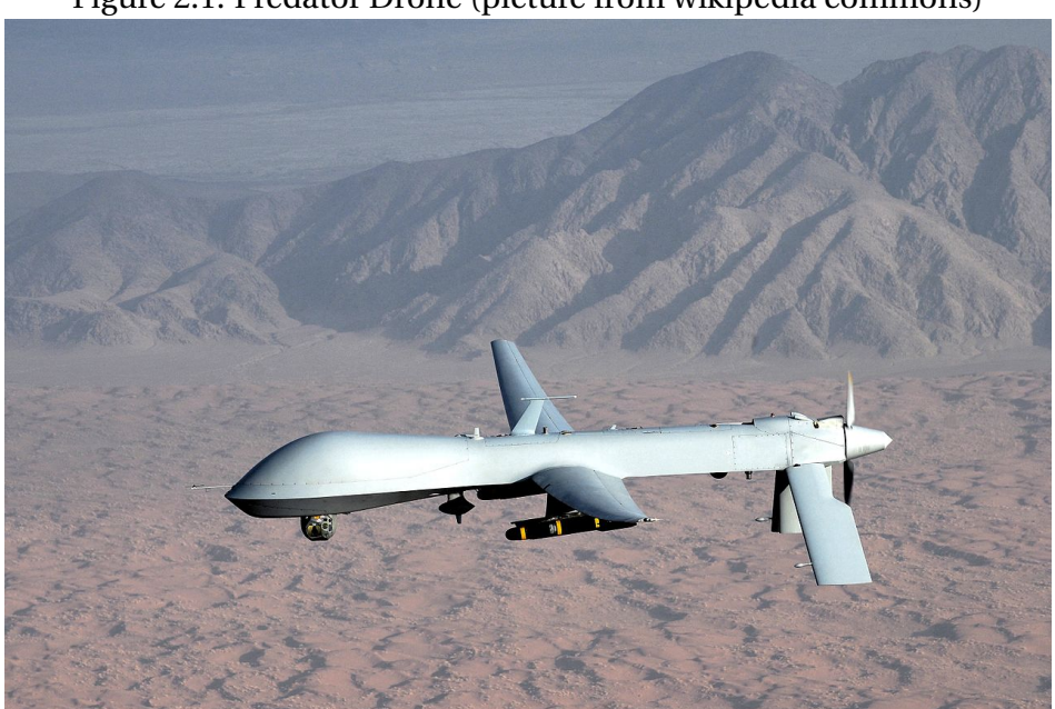
Figure 2.1: Predator Drone

of this is the Kaman K-Max helicopter(7), delivering towed loads to friendly and hard to reach outposts. This unmanned helicopter has also been used in firefighting (8), where it automatically identifies hotspots and dumps water on them. It does this by cooperating with a quad-rotor drone, Lockheed's Indago, that acts as a sensor platform, providing information about the fire to fire-fighters on the ground. The system can also operate at night and in heavy smoke, something manned systems cannot do. This results in 2-3 times as many sorties as a manned system. The helicopter has also been tested for autonomous casualty evacuation (9; 10). This was done in tandem with a UGV (unmanned ground vehicle), that navigated to and found the wounded person (in the test case it was a mannequin).