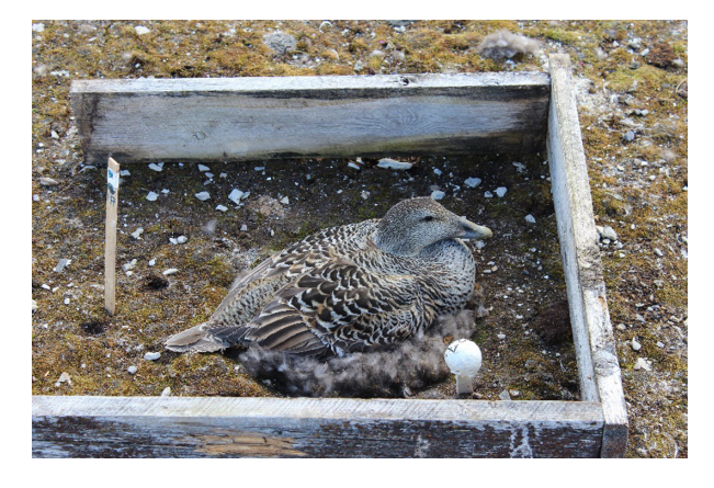
Figure 1. Female common eider ( Somateria mollissima ) with an artificial shelter and the temperature/humidity logger inside. A white plastic ball with air vents was placed around the logger to prevent exposure to direct sunlight.

At first capture, a temperature and humidity logger (iButton Hydrocron DS1921—Maxim Integrated Products, Sunnyvale, CA, USA) was placed approx. 10 cm from the edge of each nest at eider head height (Fig. 1). Ambient temperature and humidity were logged every 10 min until the logger was retrieved at the second capture. In 2014, an anemometer (Davis Instruments, Hayward, CA, USA), logging wind speed and direction, was placed on the island and the wind data were recorded during the whole study period. Mean wind speed measured on the island in 2014 was 2.77 m/s (SD = 0.29) with a mean wind direction of 203.4 degrees (SD = 79.1). Wind