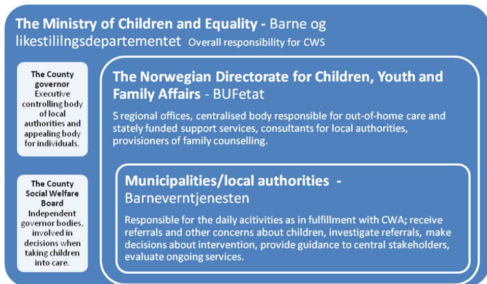
Figure 1 The Organisation of Child Welfare Services in Norway.

Figure 1 outlines the organisational framework of the CWS in Norway, with responsibility for providing and arranging services being shared between the municipalities and the central authorities. The responsibility for the provision of services occurs on two levels. Although the CWS in Norway is enacted legislatively on a national level, the day-to-day activities are operated on a local level. The Norwegian Directorate for Children, Youth, and Family Affairs (Bufetat) is a centralised authority, which is responsible for the recruitment and provision of out-of-home care, such as foster homes and institutions. The local CWS (municipalities) are responsible for guidance, accepting and evaluating referrals, investigating children’s situations and also acting as organisers, coordinators and providers of most of the direct services. Each municipality has a high degree of political autonomy in the